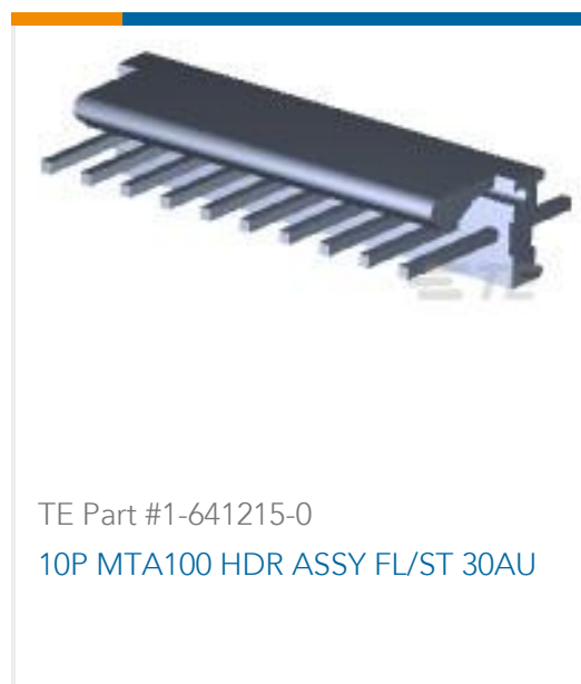
TE Part #1-641215-0 10P MTA100 HDR ASSY FL/ST 30AU