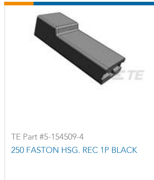
TE Part #5-154509-4 250 FASTON HSG. REC 1P BLACK