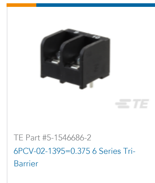
TE Part #5-1546686-2 6PCV-02-1395=0.375 6 Series Tri-Barrier