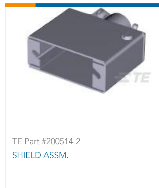
TE Part #200514-2 SHIELD ASSM.