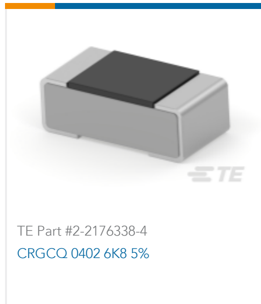
TE Part #2-2176338-4 CRGCQ 0402 6K8 5%