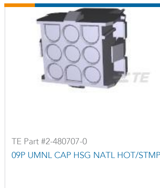
TE Part #2-480707-0 09P UMNL CAP HSG NATL HOT/STMP