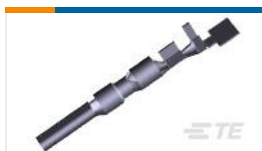
TE Part #1-794227-0 MINI UMNL2 SOK 26-22 AWG LP LF