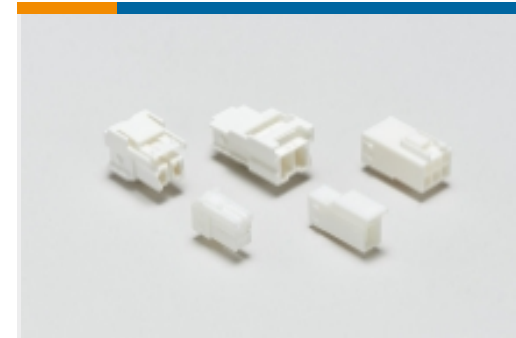
Rectangular Power Connectors(45)