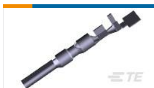
TE Part #794227-1 MINI UMNL2 SOK 26-22 AWG SN LP