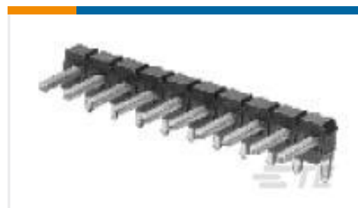
TE Part #826947-8 8P MOD2 STIFT LEI