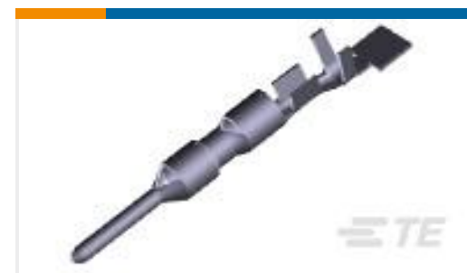
TE Part #1-794226-0 MINI UMNL2 PIN 26-22AWG LP LF