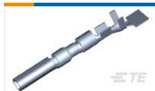
TE Part #1-794219-0 MINI UNML2 SOK 26-22 AWG AU LF