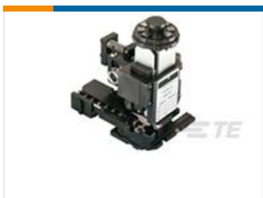
TE Part # 680602-3 HDM 55MPR055F055O G