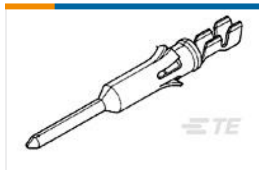
TE Part #66589-4 TYPE VI PIN, MULTI-MATE, L.P.