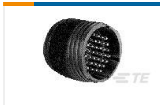
TE Part #206153-1 11-4 F.H. RECEPT. STD. SEX