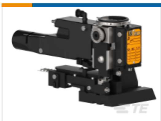
TE Part # 2-2836121-2 OC-PA-S-FA-055F055O-001-0021