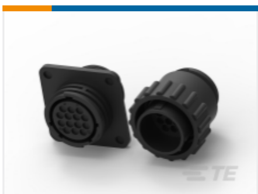
TE Part # CAT-AM71-C83998K Circular Connector, Environmentally Sealed, CPC Series 6