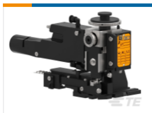
TE Part # 2836121-2 OC-AT-S-FA-055F055O-001-0021