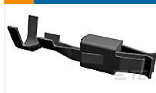
TE Part #929939-3 JPT REC 2.8 Contact SWS Sn