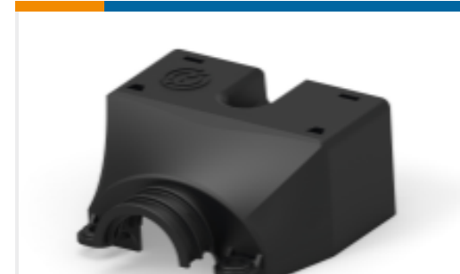
TE Part #776501-1 WIRE DRESS COVER, TALL, 68 POS