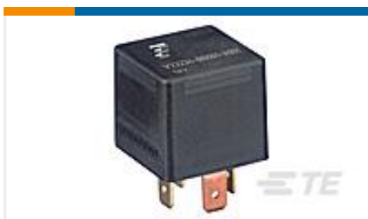
TE Part #1-1904027-1 V23234A1004X050-EV-100