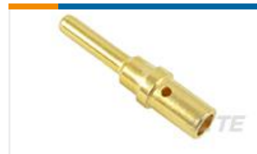
TE Part #0460-220-1231 PIN, SOLID, SIZE 12,12-14AWG, AU