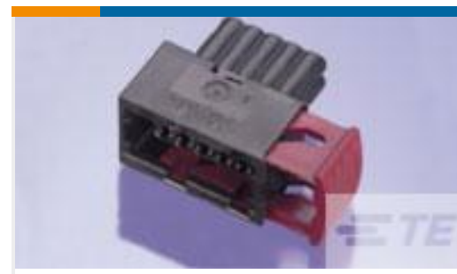
TE Part #2-967059-1 J-P-T GEH KOMPL 4P