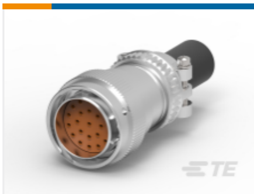
TE Part #HD36-24-23PE-059 PLG,23P,AL,E, CBL CLMP BT, DRAIN, 16,P,MC