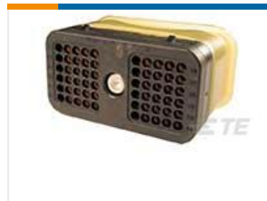
TE Part #DRC26-60S07 PLG, 60P, BLK, N, 07