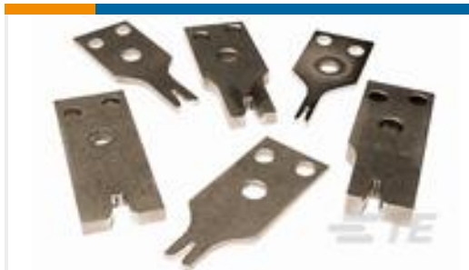
TE Part #217885-6 CRIMPER, WIRE "F"