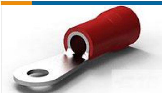
TE Part #52263-3 TERMINAL R PG 8 10