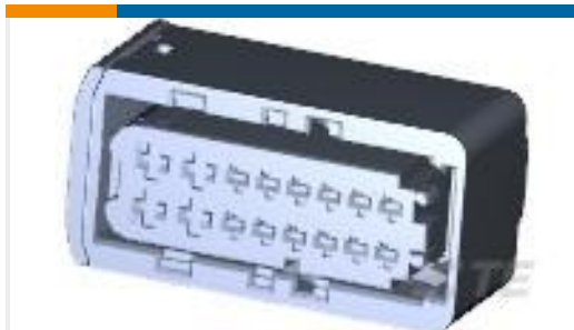
TE Part #3-1564337-1 16POS, MIXED,REC HSG,ASSY