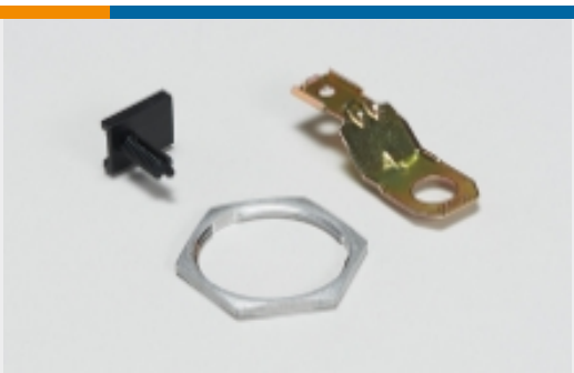
Other Automotive Connector Accessories(11)