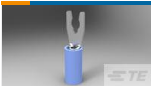
TE Part #52934-1 TERMINAL,PIDG SPR SPD 16-14 5