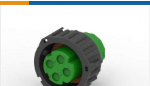
TE Part #3-967325-1 2,5MM BU-GEH 4P,GN