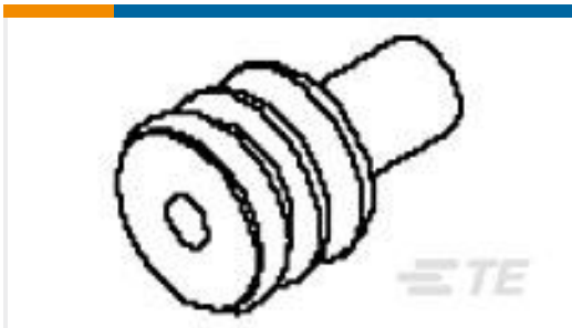
TE Part #184139-1 WIRE SEAL,RUBBER,SENSOR,BLUE