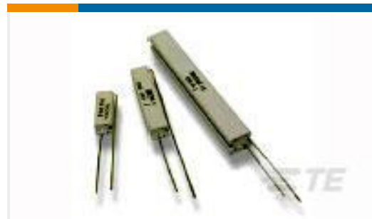
TE Part #1623722-4 SBCH 11 33R 5%