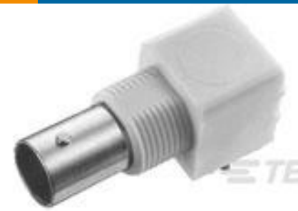
TE Part #5415633-1 RTANG BNC PCB JACK - 75 OHM