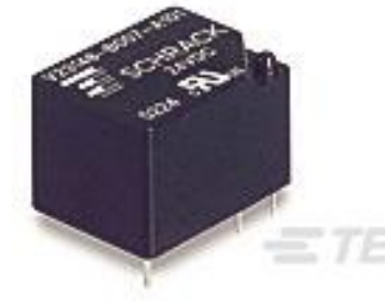
TE Part #2-1393203-8 V23148-A1007-A101