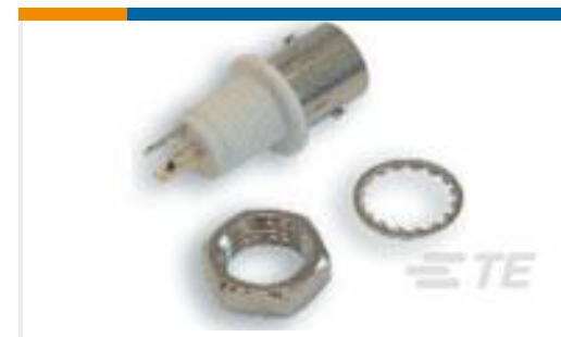
TE Part #1-1337450-0 BNC BHSkt + TAG 50Ohm Silver Pltd