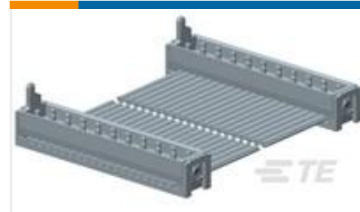
TE Part #1483358-3 MICRO-MATCH LEAD 20P 250MM