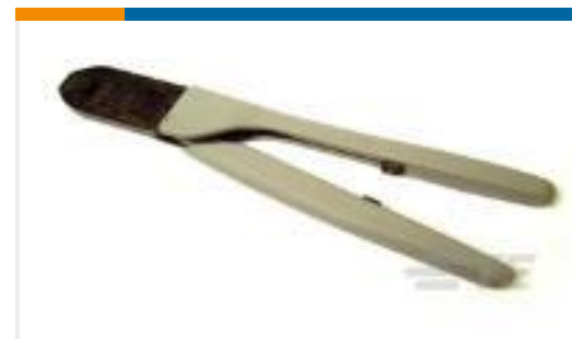
TE Part #91596-1 CCII D-5 SS REC TAB 20-16 ASSY