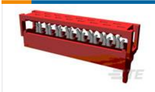
TE Part #1-215083-0 MICRO-MATCH MOW.10P