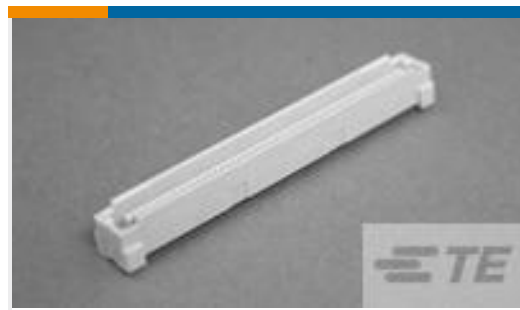
TE Part # 5179029-1 0.8FH,P06H.5,040,08/Sn,TU