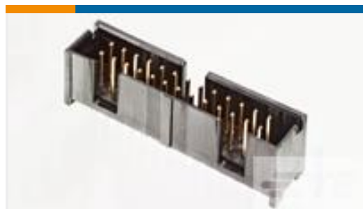
TE Part #5103309-6 A/L LOW PRO HDR 26P VERT BLACK