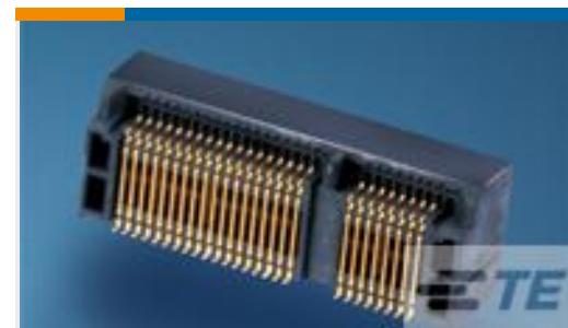
TE Part #1759546-1 0.8mm Mini PCI-Express 9.9 Height