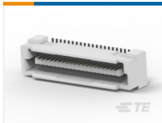
TE Part # CAT-313-PCB40 Free Height Plug Connector: Board-Board, Vertical, 40, 0.8mm