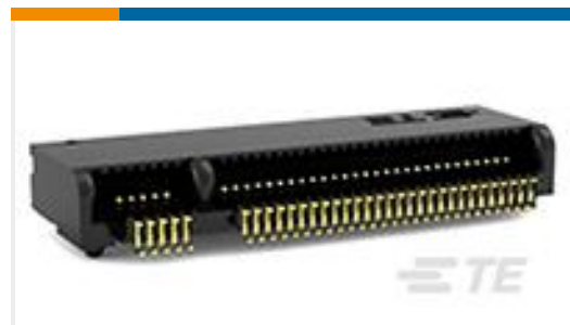
TE Part #2199119-4 M.2 0.5PITCH 3.2H KEY E 15U" AU