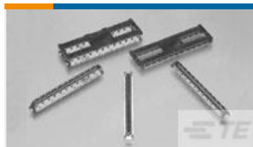
TE Part #3-6318490-6 .5FHR04H,220,S,GIG,08/Sn,HT,NSYes