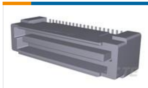
TE Part # 1735434-1 0.8FH,P08H.5,040,08/Sn,TR,KT