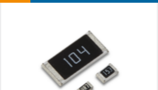
TE Part #3-2176345-5 CRGCQ 1210 6K8 1%