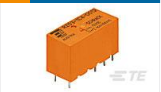
TE Part #4-1415899-5 RZ01-1C3-D024