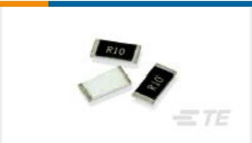
TE Part #2-2176055-2 RLP73N 2B R075 1% 1K RL