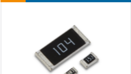
TE Part #3-2176345-4 CRGCQ 1210 5K6 1%