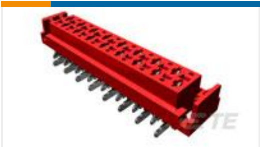
TE Part #9-338069-0 MICRO-MATCH SMD FTE