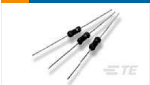
TE Part #1879352-3 RR02 5% R39 AMMO