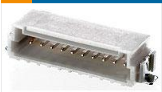
TE Part #292228-7 1.5 MINI CT SGL H SMT W/O BOSS