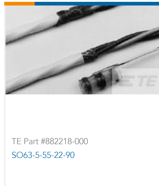
TE Part #882218-000 SO63-5-55-22-90