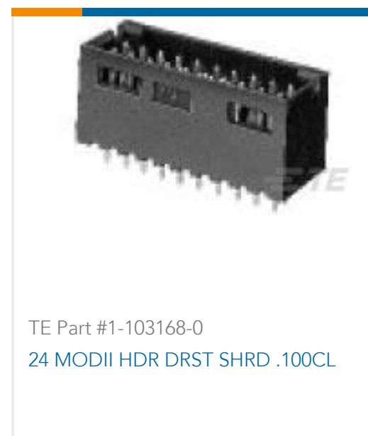
TE Part #1-103168-0 24 MODII HDR DRST SHRD .100CL