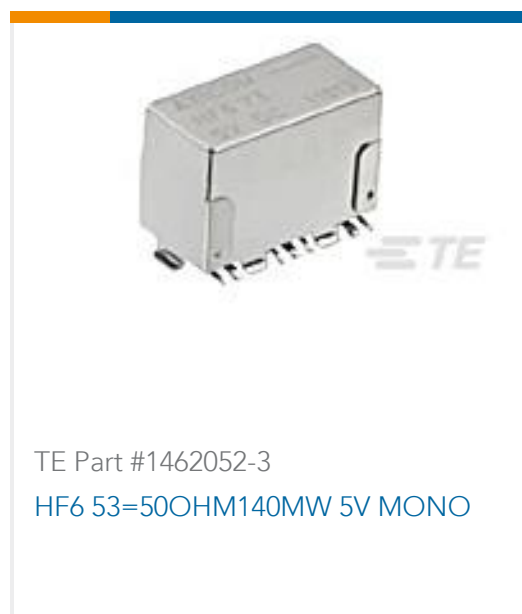
TE Part #1462052-3 HF6 53=50OHM140MW 5V MONO