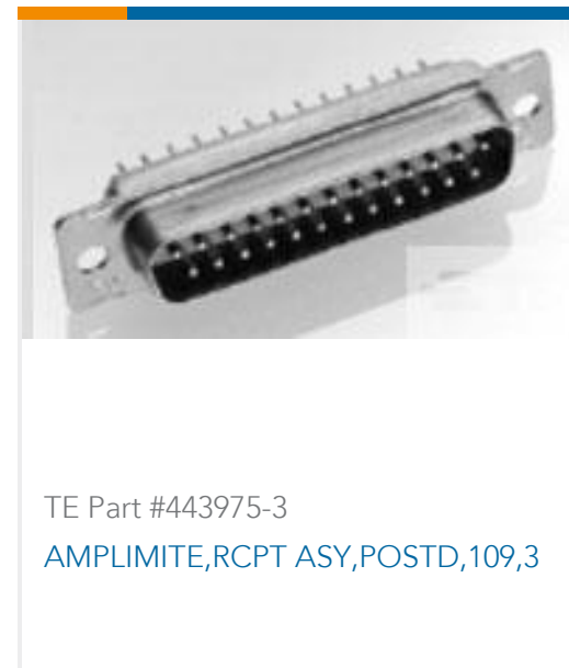
TE Part #443975-3 AMPLIMITE,RCPT ASY,POSTD,109,3