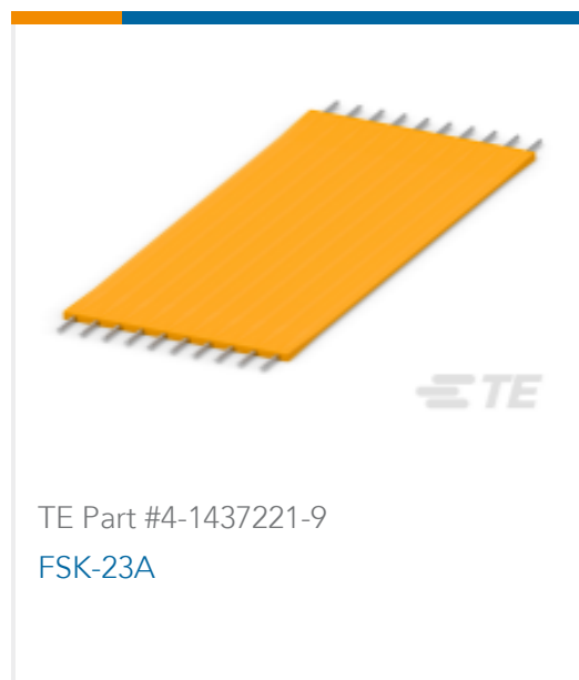
TE Part #4-1437221-9 FSK-23A