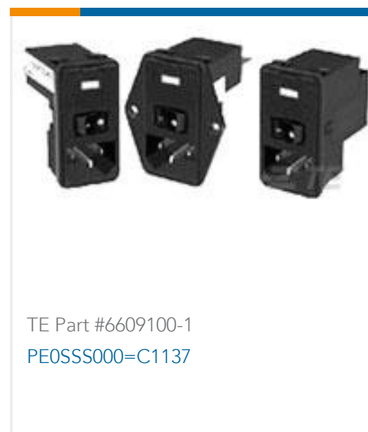
TE Part #6609100-1 PE0SS000=C1137