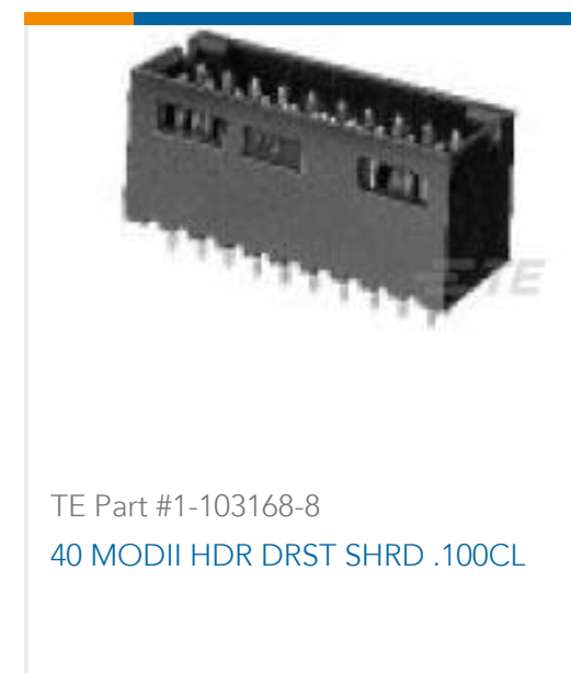
TE Part #1-103168-8 40 MODII HDR DRST SHRD .100CL