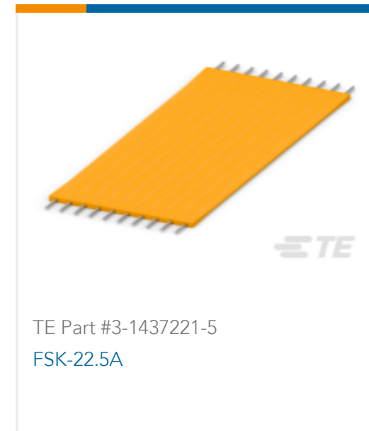
TE Part #3-1437221-5 FSK-22.5A