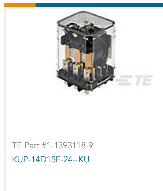
TE Part #1-1393118-9 KUP-14D15F-24=KU