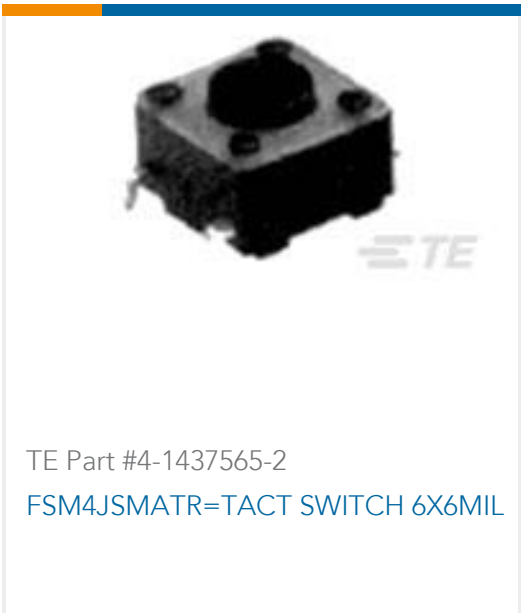
TE Part #4-1437565-2 FSM4JSMATR=TACT SWITCH 6X6MIL