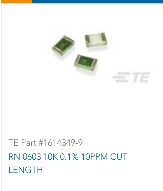
TE Part #1614349-9 RN 0603 10K 0.1% 10PPM CUT LENGTH