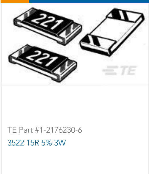
TE Part #1-2176230-6 3522 15R 5% 3W