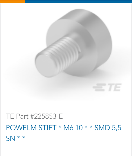
TE Part #225853-E POWELM STIFT * M6 10 ** SMD 5,5 SN **