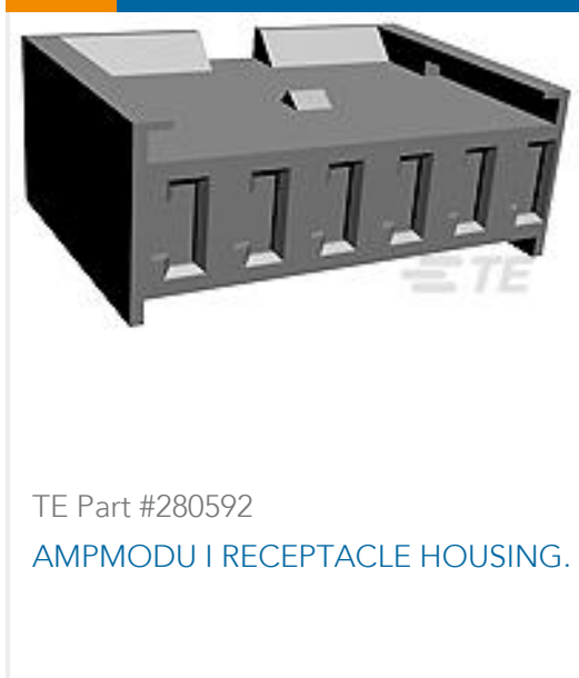
TE Part #280592 AMPMODU I RECEPTACLE HOUSING.