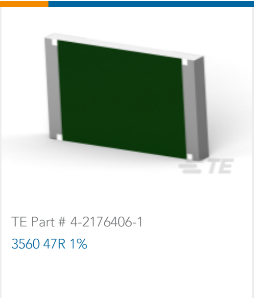
TE Part # 4-2176406-1 3560 47R 1%