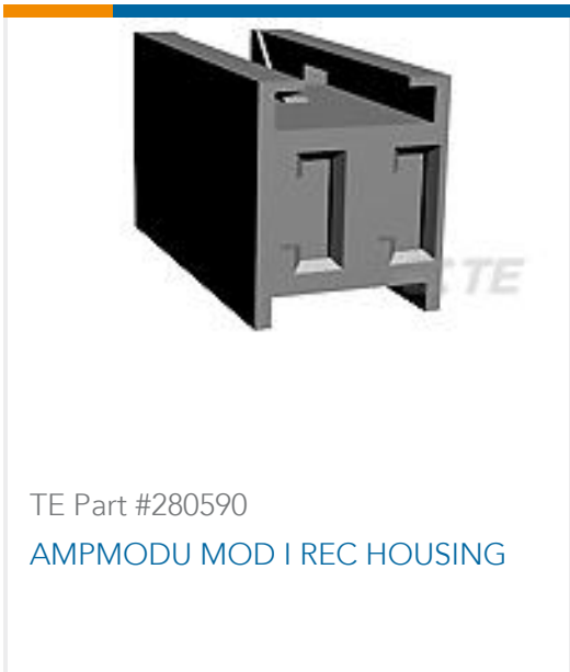
TE Part #280590 AMPMODU MOD I REC HOUSING