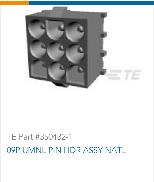
TE Part #350432-1 09P UMNL PIN HDR ASSY NATL