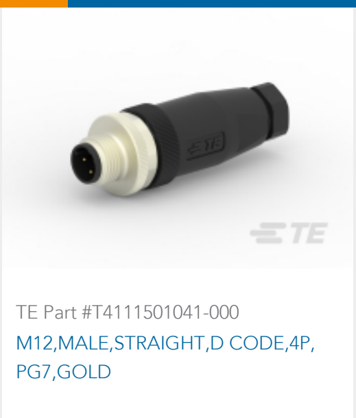
TE Part #T4111501041-000 M12,MALE,STRAIGHT,D CODE,4P, PG7,GOLD