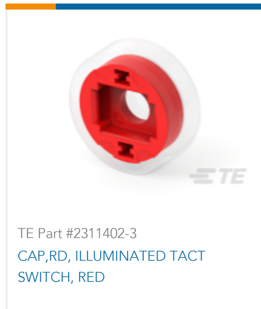
TE Part #2311402-3 CAP,RD, ILLUMINATED TACT SWITCH, RED