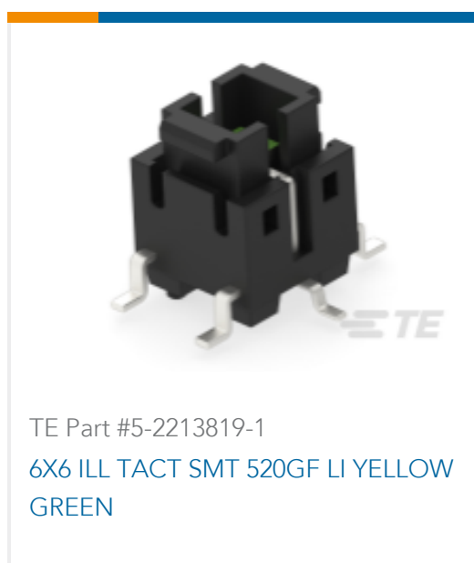
TE Part #5-2213819-1 6X6 ILL TACT SMT 520GF LI YELLOW GREEN