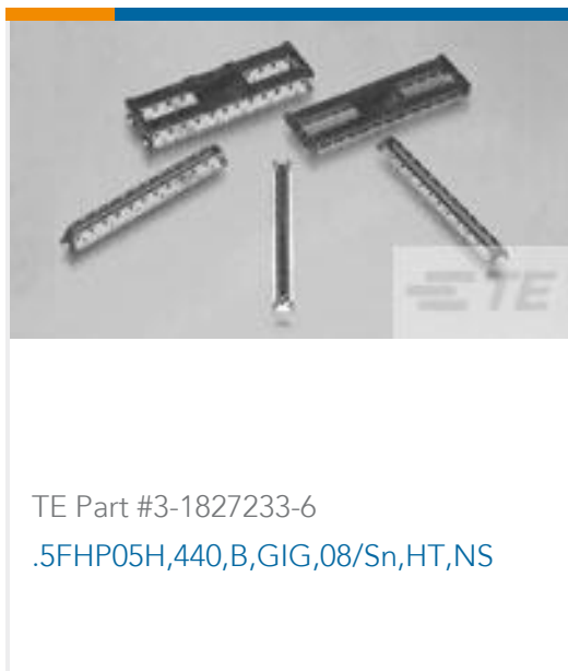
TE Part #3-1827233-6 .5FHP05H,440,B,GIG,08/Sn,HT,NS