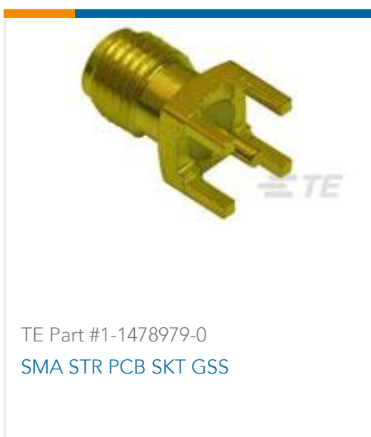
TE Part #1-1478979-0 SMA STR PCB SKT GSS