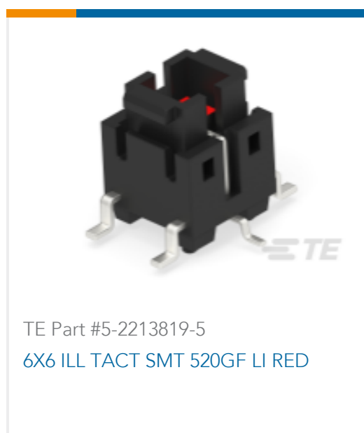
TE Part #5-2213819-5 6X6 ILL TACT SMT 520GF LI RED