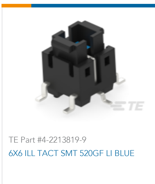
TE Part #4-2213819-9 6X6 ILL TACT SMT 520GF LI BLUE