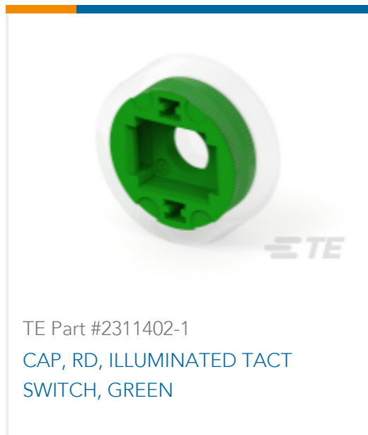
TE Part #2311402-1 CAP, RD, ILLUMINATED TACT SWITCH, GREEN