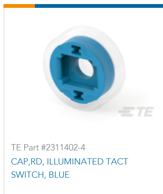
TE Part #2311402-4 CAP,RD, ILLUMINATED TACT SWITCH, BLUE