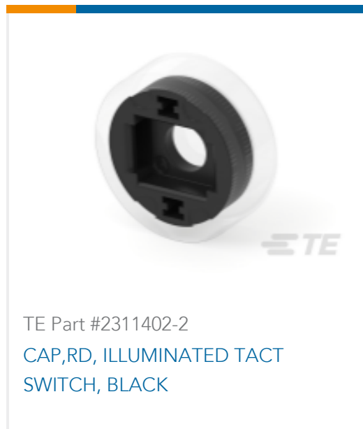
TE Part #2311402-2 CAP,RD, ILLUMINATED TACT SWITCH, BLACK