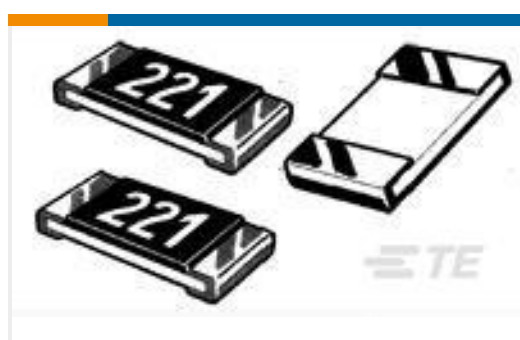
TE Part #5-2176231-6 3522 2K0 1% 3W