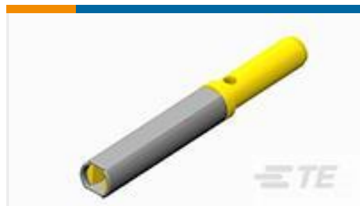
TE Part #450213-000 CTA-0165