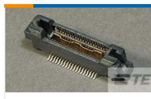
TE Part #5767007-8 MICT,260PLUG,38,ASSY,.025,REC