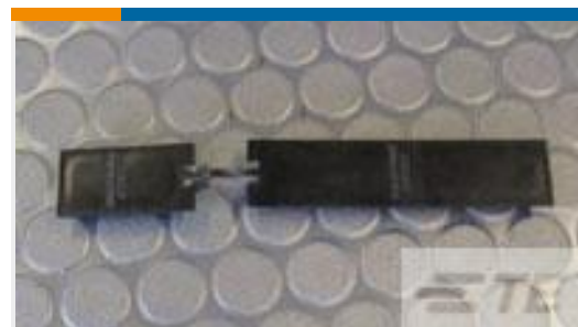
TE Part #211600-2 DUST COVER,SZ 2,NIC 600