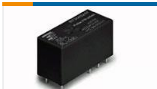
TE Part #3-1393237-3 RTE24024F