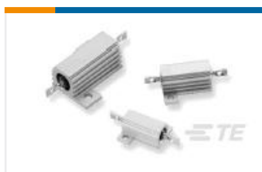
TE Part #1-1879075-4 THS25 1R5 5%