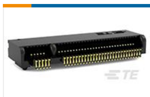
TE Part #2199119-3 M.2 0.5PITCH 3.2H KEY B 15U" AU