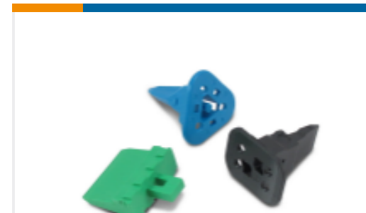
TE Part #W2S Wedgelocks: DEUTSCH DT