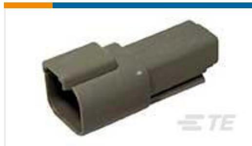
TE Part #DT04-2P REC, 2P, GRY, N