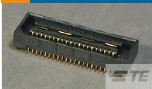
TE Part # 7-1658012-1 MSB0.80RC-ASY28DP,GP,10,VCTR