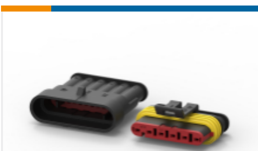
TE Part #282104-1 AMP SUPERSEAL 1.5MM, CONNECTOR HOUSING