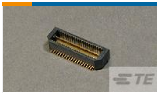
TE Part # 7-1658013-1 MSB0.80PL5ASY28DP,GP,10,VCTR