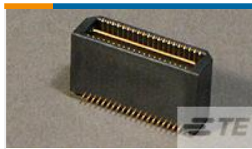
TE Part # 7-1658015-1 MSB0.80PL11ASY28DP,GP,10,VCTR