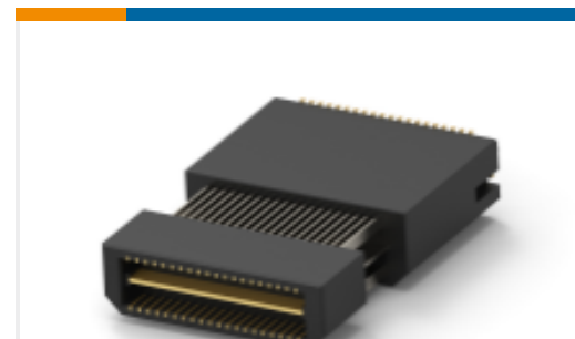
TE Part # 7-1658016-1 MSB0.80PL16ASY28DP,GP,10,VCTR