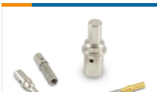
TE Part #0462-201-16141 DEUTSCH Solid Contacts