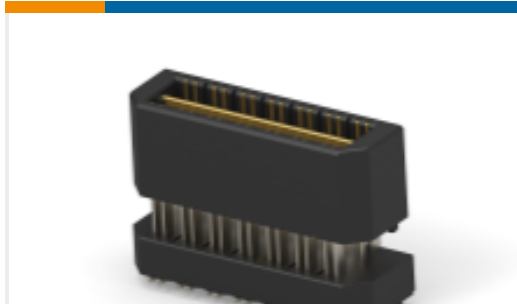
TE Part # 7-1658438-1 MSB0.80PL14ASY28DP,GP,10,VCTR