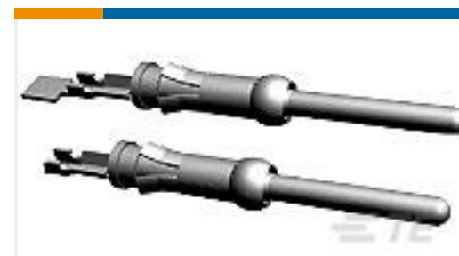
TE Part #1-66099-5 III+ PIN, 18-16, TIN, LP