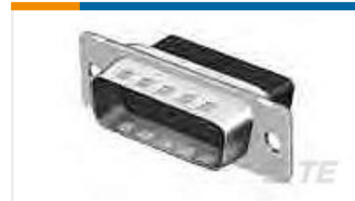
TE Part #207464-2 CRIMP SNAP PLUG ASSY, SZ 3