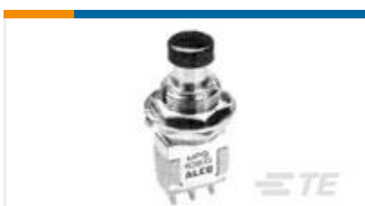
TE Part #5-1437567-0 MPG106F=(MSPG) SWITCH PUSHBUTT