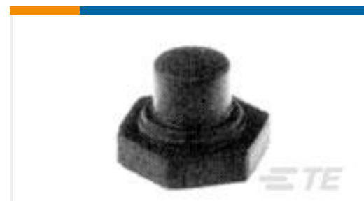
TE Part #1825603-1 BP1532004=Boot, Pushbutton