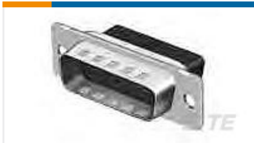
TE Part #205206-9 CRIMP SNAP PLUG ASSY, SIZE 2