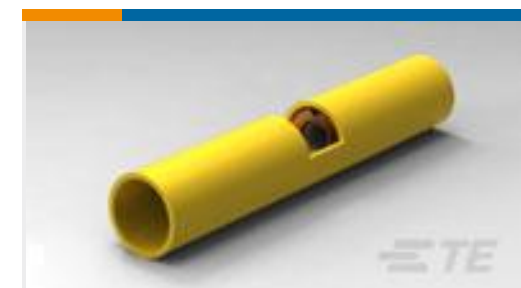
TE Part #323975 SPLICE, BUTT, PIDG, 24-20