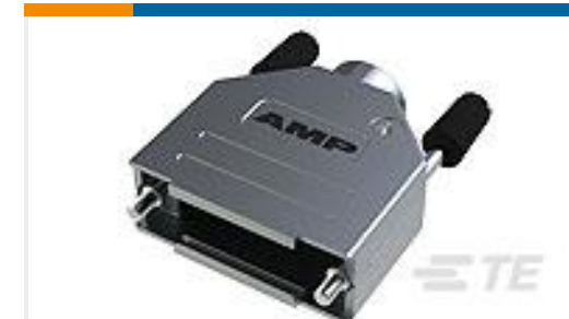
TE Part #1478762-9 METAL BACKSHELL 9 WAY TOP E