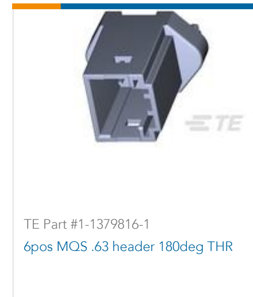
TE Part #1-1379816-1 6pos MQS .63 header 180deg THR