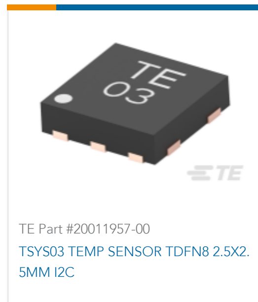
TE Part #20011957-00 TSYS03 TEMP SENSOR TDFN8 2.5X2. 5MM I2C