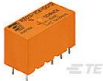
TE Part # 2-1415899-3 RZ03-1C4-D024