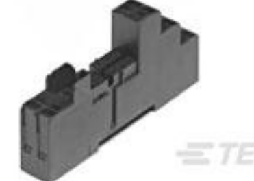
TE Part # 1860200-1 RT7872P