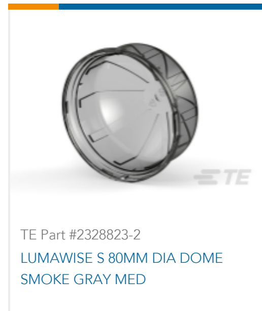
TE Part #2328823-2 LUMAWISE S 80MM DIA DOME SMOKE GRAY MED