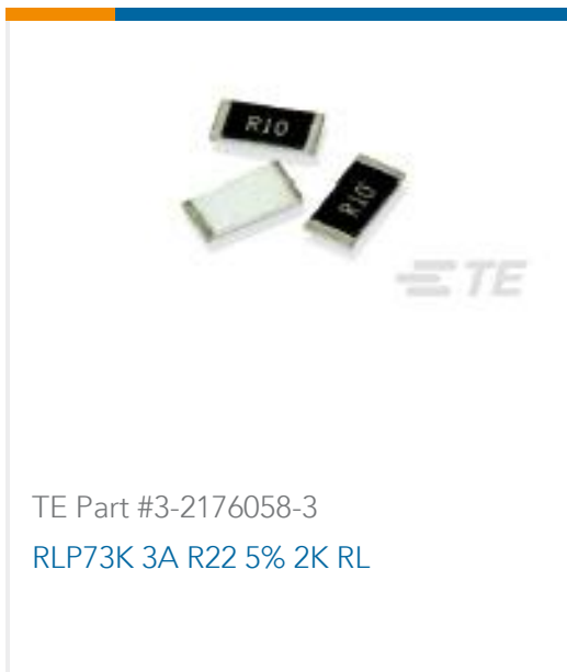
TE Part #3-2176058-3 RLP73K 3A R22 5% 2K RL