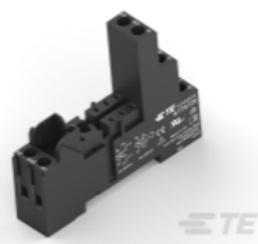
TE Part # 6-1415035-1 RT78726