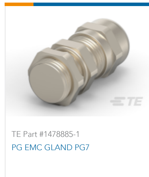
TE Part #1478885-1 PG EMC GLAND PG7