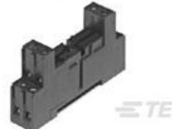
TE Part # 1860306-1 RT78725