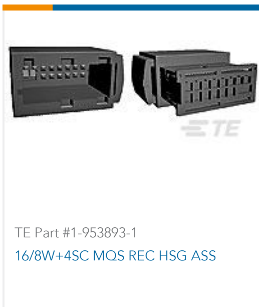
TE Part #1-953893-1 16/8W+4SC MQS REC HSG ASS