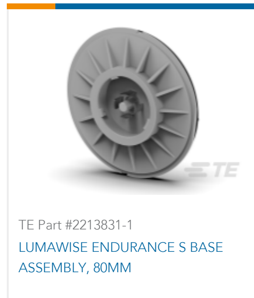
TE Part #2213831-1 LUMAWISE ENDURANCE S BASE ASSEMBLY, 80MM