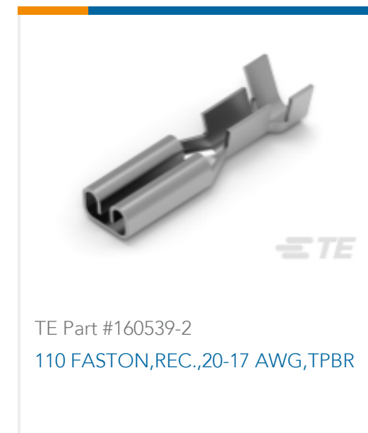
TE Part #160539-2 110 FASTON,REC.,20-17 AWG,TPBR