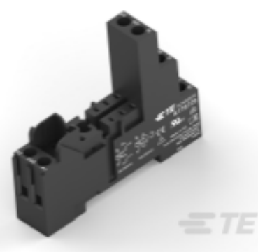
TE Part # 6-1415035-1 RT78726