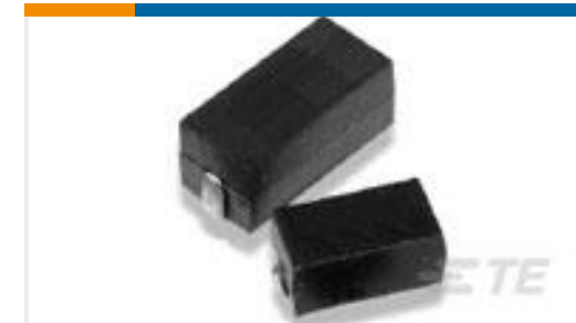
TE Part #4-1676966-7 SMW2 8R2 5%