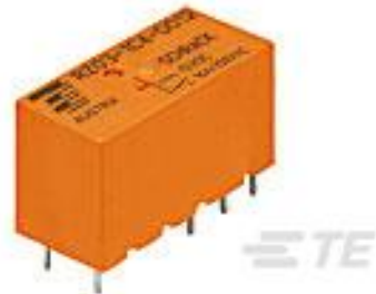
TE Part # 1-1415899-6 RZ03-1A4-D012