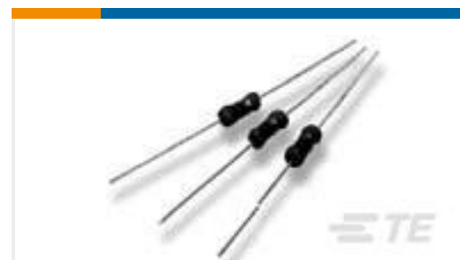
TE Part #7-1625892-7 3W SM M/OX 5% 18K