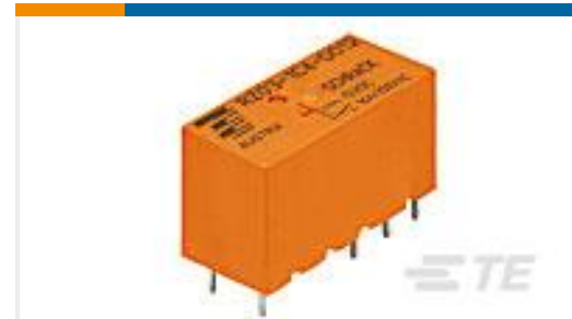
TE Part #1-1415899-6 RZ03-1A4-D012