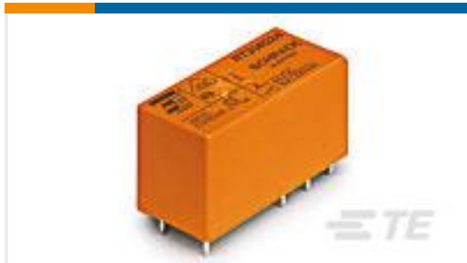
TE Part #1415898-5 RTS3TF12