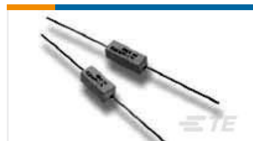
TE Part #1-1623819-4 SBL4 R051 5%