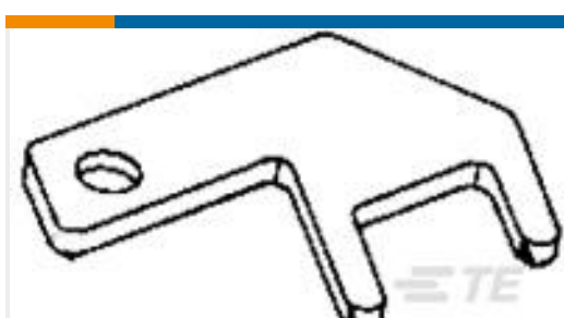
TE Part #725996-2 110 FASTON TAB TPBR