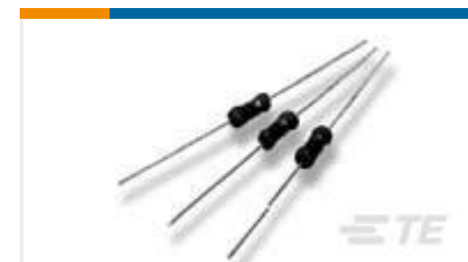
TE Part #1879352-5 RR02 5% R47 AMMO