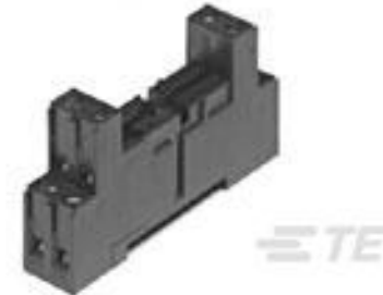
TE Part # 1860306-1 RT78725