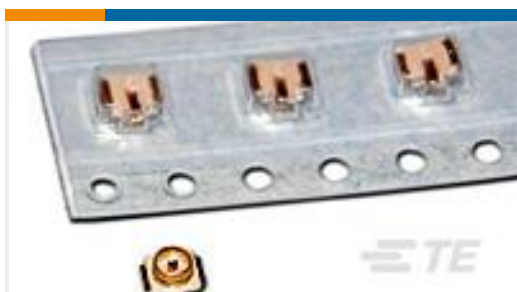
TE Part #1909763-1 UMCC MICRO-COAX RECPT GEN 1 HIGHER LEVEL