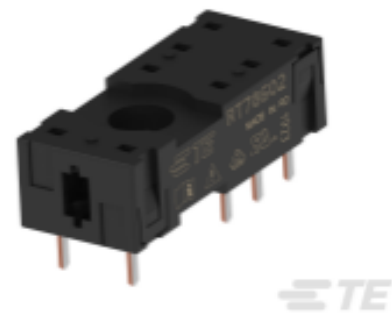
TE Part # 1860991-1 RT78602, RELAY SOCKET PCB 5MM

Also in the Series | SCHRACK Power PCB Relay RZ