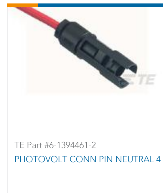
TE Part #6-1394461-2 PHOTOVOLT CONN PIN NEUTRAL 4 s