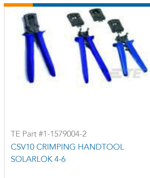
TE Part #1-1579004-2 CSV10 CRIMPING HANDTOOL SOLARLOK 4-6