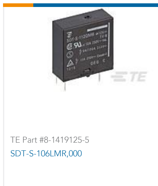
TE Part #8-1419125-5 SDT-S-106LMR,000