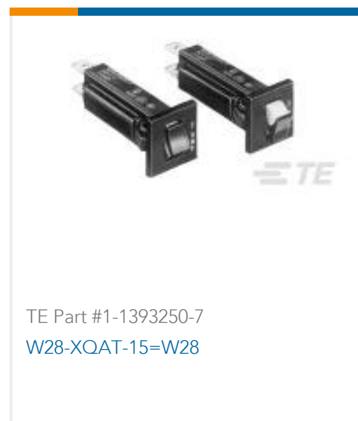
TE Part #1-1393250-7 W28-XQAT-15=W28