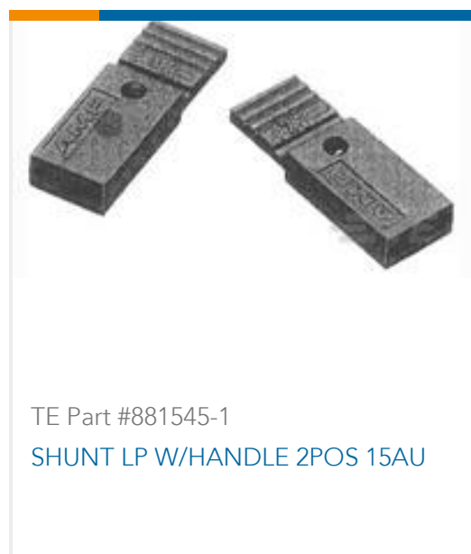
TE Part #881545-1 SHUNT LP W/HANDLE 2POS 15AU