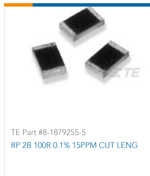
TE Part #8-1879255-5 RP 2B 100R 0.1% 15PPM CUT LENG