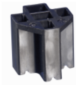
TE Part # 1-1904045-1 V23333Z0001A007-EV-100

This information is provided based on reasonable inquiry of our suppliers and represents our current actual knowledge based on the information they provided. This information is subject to change. The part numbers that TE has identified as EU RoHS compliant have a maximum concentration of 0.1% by weight in homogenous materials for lead, hexavalent chromium, mercury, PBB, PBDE, DBP, BBP, DEHP, DIBP, and 0.01% for cadmium, or qualify for an exemption to these limits as defined in the Annexes of Directive 2011/65/EU (RoHS2). Finished electrical and electronic equipment products will be CE marked as required by Directive 2011/65/EU. Components may not be CE marked. Additionally, the part numbers that TE has identified as EU ELV compliant have a maximum concentration of 0.1% by weight in homogenous materials for lead, hexavalent chromium, and mercury, and 0.01% for cadmium, or qualify for an exemption to these limits as defined in the Annexes of Directive 2000/53/EC (ELV). Regarding the REACH Regulation, the information TE provides on SVHC in articles for this part number is based on the latest European Chemicals Agency (ECHA) ‘Guidance on requirements for substances in articles’ posted at this URL: https://echa.europa.eu/guidance-documents/guidance-on-reach