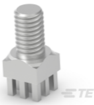
TE Part #225777-E POWELM STIFT VOLLM M5 8 2,54 * EP 4,0 *