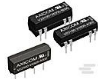
TE Part #4-1393763-4 V23100V4505A000