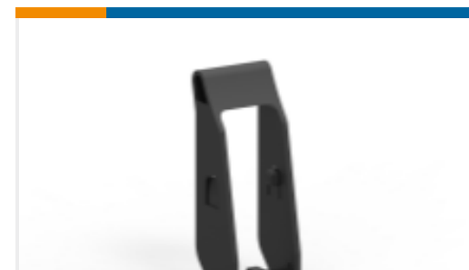
TE Part #2022103-1 RT17017