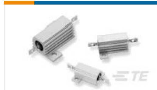
TE Part #5-1879071-8 THS50 6K8 5%