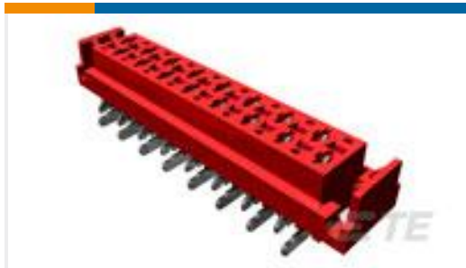
TE Part #1-338069-2 MICRO-MATCH SMD FTE