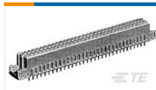
TE Part #650408-5 064 EURO TYPE C RECEPT ST ASSY