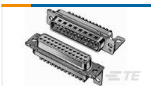
TE Part #8-1393480-7 V23529B1223C225=SUB D STIFTL