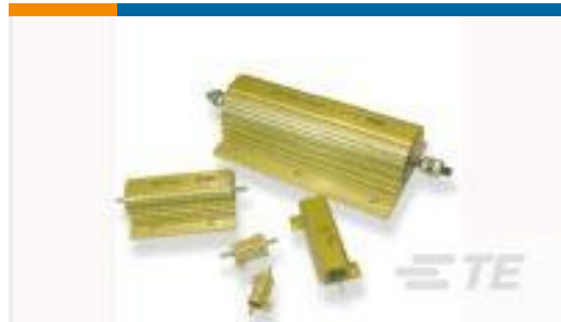
TE Part #5-1625984-2 HSA50 390R 5%