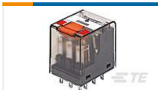
TE Part #9-1419111-1 PT570730