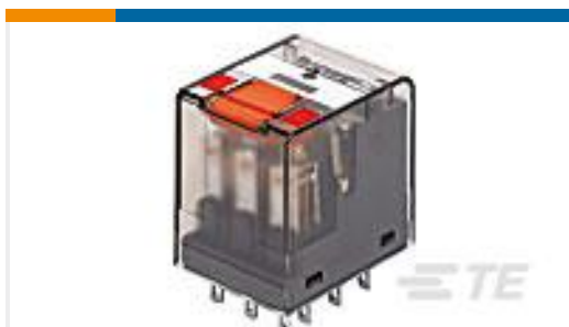
TE Part #6-1419111-3 PT370110