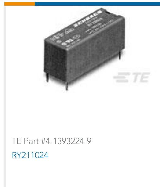
TE Part #4-1393224-9 RY211024