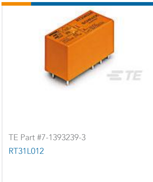
TE Part #7-1393239-3 RT31L012