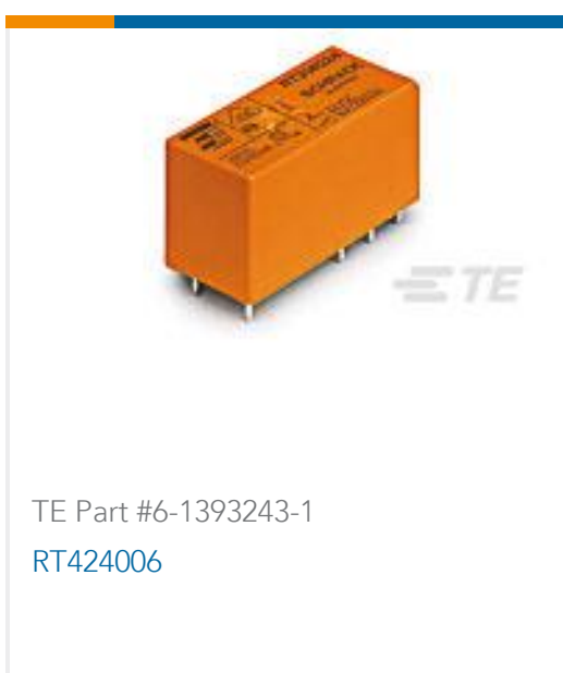
TE Part #6-1393243-1 RT424006