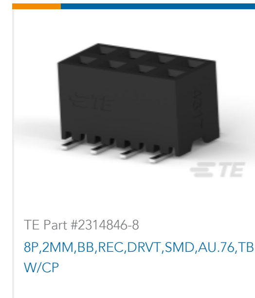
TE Part #2314846-8 8P,2MM,BB,REC,DRVT,SMD,AU.76,TB, W/CP