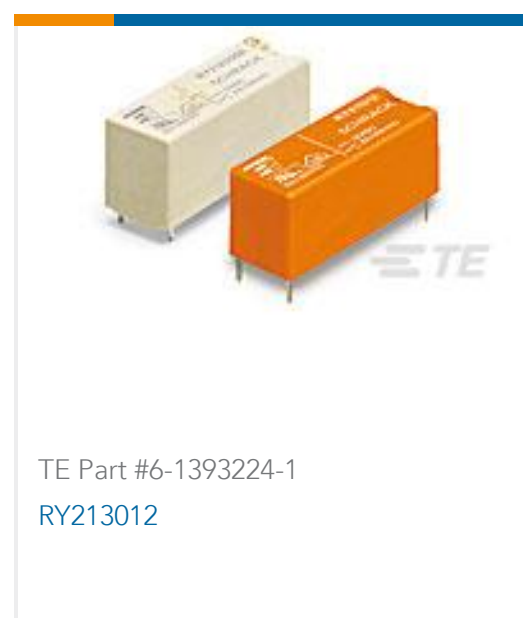
TE Part #6-1393224-1 RY213012