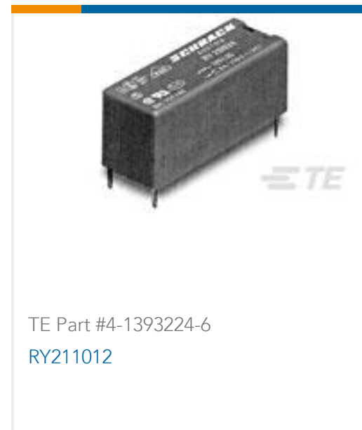
TE Part #4-1393224-6 RY211012