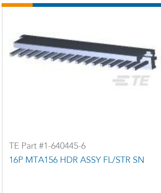
TE Part #1-640445-6 16P MTA156 HDR ASSY FL/STR SN