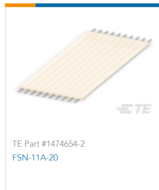
TE Part #1474654-2 FSN-11A-20