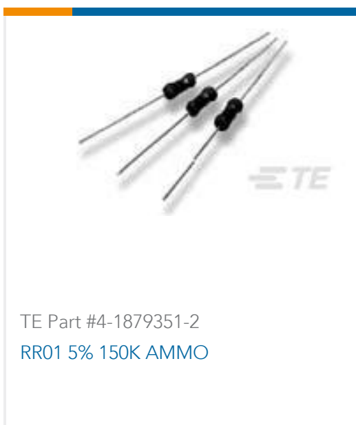
TE Part #4-1879351-2 RR01 5% 150K AMMO