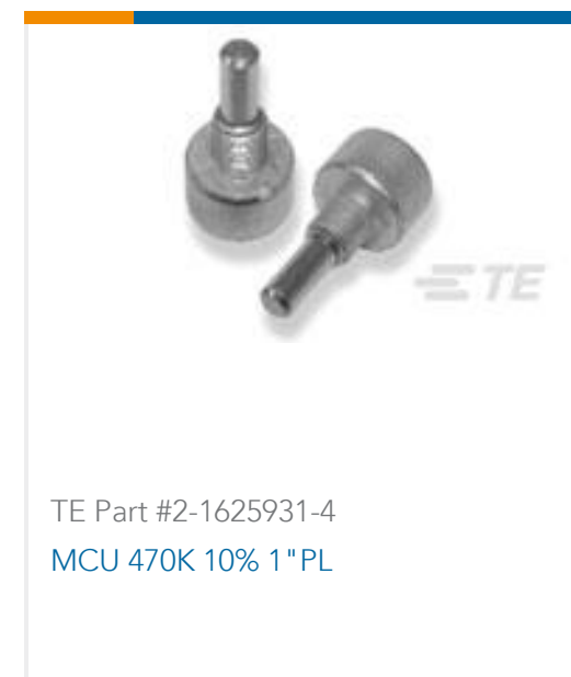
TE Part #2-1625931-4 MCU 470K 10% 1" PL