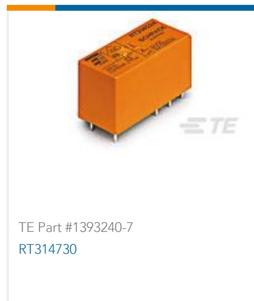
TE Part #1393240-7 RT314730