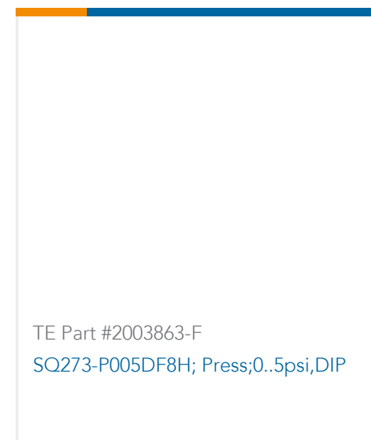
TE Part #2003863-F SQ273-P005DF8H; Press;0..5psi,DIP