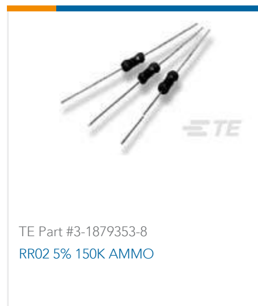
TE Part #3-1879353-8 RR02 5% 150K AMMO