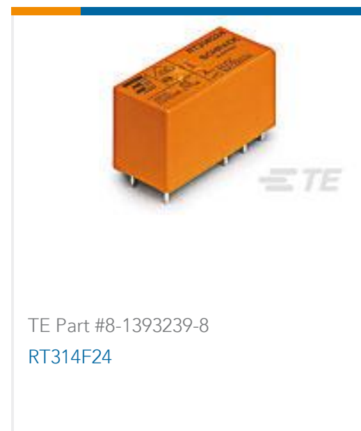
TE Part #8-1393239-8 RT314F24