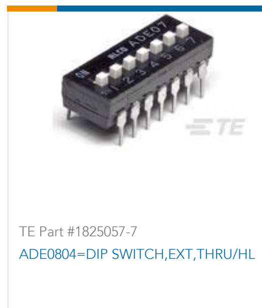
TE Part #1825057-7 ADE0804=DIP SWITCH,EXT,THRU/HL