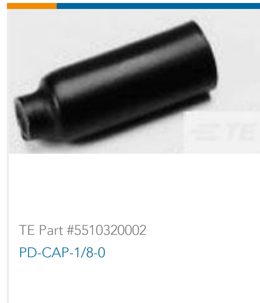
TE Part #5510320002 PD-CAP-1/8-0