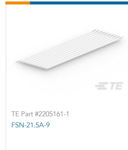
TE Part #2205161-1 FSN-21.5A-9