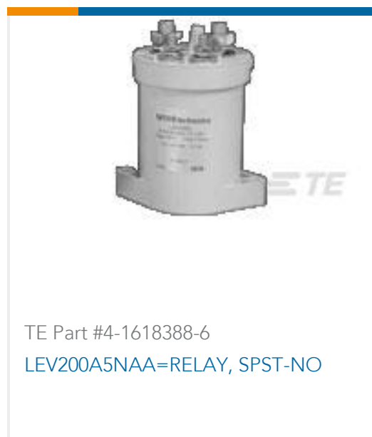
TE Part #4-1618388-6 LEV200A5NAA=RELAY, SPST-NO