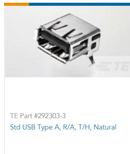
TE Part #292303-3 Std USB Type A, R/A, T/H, Natural