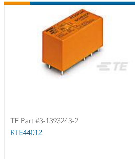
TE Part #3-1393243-2 RTE44012