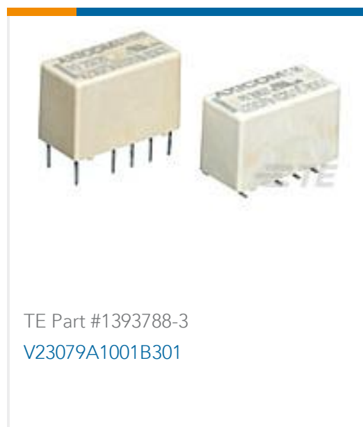
TE Part #1393788-3 V23079A1001B301