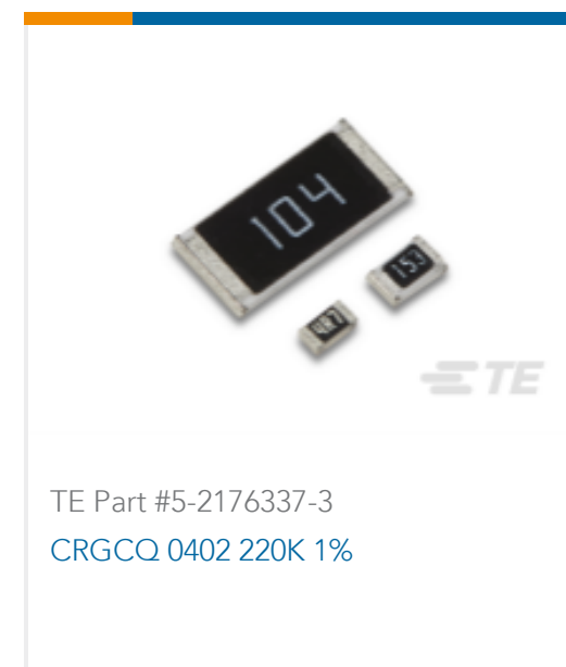
TE Part #5-2176337-3 CRGCO 0402 220K 1%