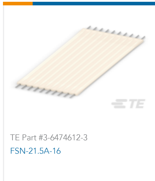
TE Part #3-6474612-3 FSN-21.5A-16