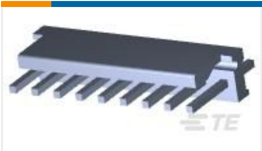
TE Part #644752-9 09P MTA156 HDR ASSY SQ STR F/L