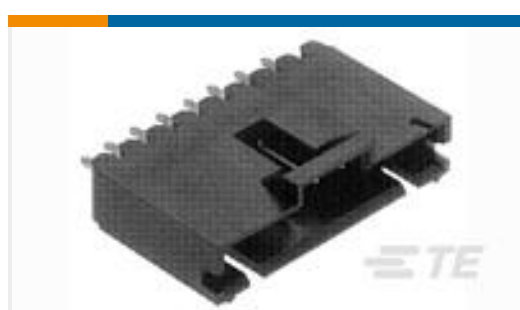
TE Part #5-103735-8 09 MTE HDR SRST LATCH .100CL