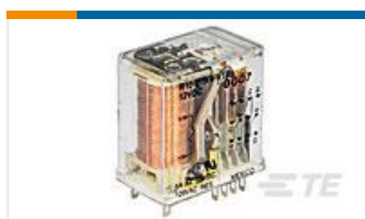
TE Part #6-1393766-1 R10-E1Y6-V430=R10