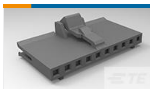
TE Part #1-487526-5 016 HOUSING FFC RCPT 100CL SR