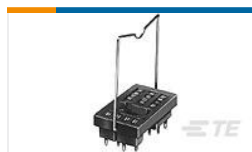
TE Part #3-1393159-7 20C251=SPRING,HOLD-DOWN,R10,0