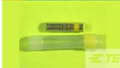
TE Part #650075N003 D-436-37CS454