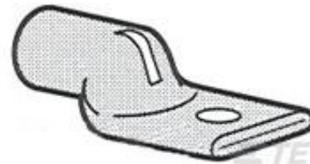
TE Part #325805 TERMINAL,AMPOWER 300MCM 1/2