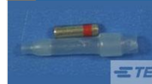
TE Part #650074N006 D-436-36CS454