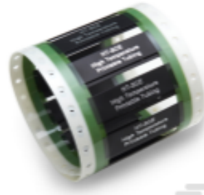
TE Part #8306110001 HT-SCE High Temperature Sleeves