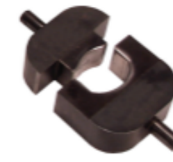
TE Part # 59867-1 HYP10 AMPOWER 3/0AWG DIE SET