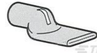
TE Part #325300 TERMINAL,AMPOWER 1/0 0