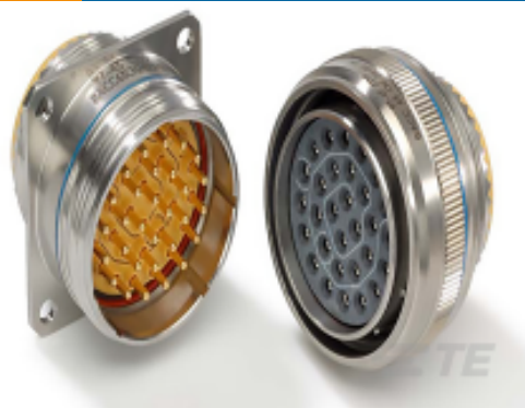
TE Part #ZPF000000000033725 983-0SE 18-08 PN-L