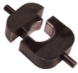
TE Part # 46749-2 HYP8 AMPOWER 3/0AWG DIE SET