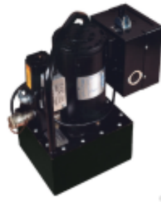
TE Part # 1804700-2 HYP10 220V HEAVY DUTY ELECTRIC PUMP