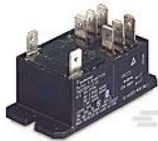
TE Part #4-1393211-4 T92P11A22-240