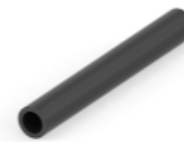
TE Part #NB17342001 RP-4800-NO.11-0-STK