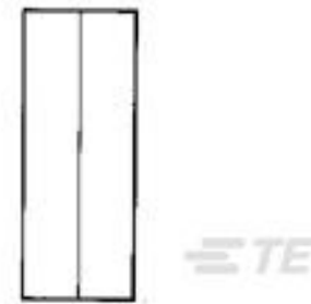
TE Part #34318 SPLICE, SOLIS PARA 8