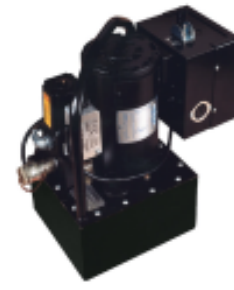
TE Part # 69120-1 HYP8 110V HEAVY DUTY ELECTRIC PUMP