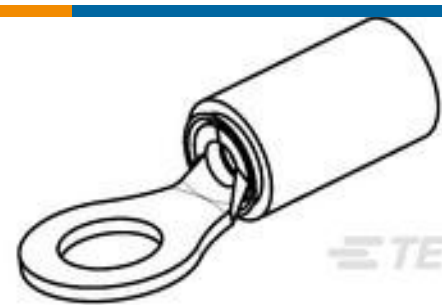
TE Part #1577640-1 TERMINAL RT PIDG PEEK STRATO 14-12 AWG