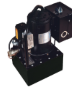
TE Part # 69120-2 HYP8 220V HEAVY DUTY ELECTRIC PUMP