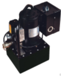
TE Part # 1804700-1 HYP10 110V HEAVY DUTY ELECTRIC PUMP