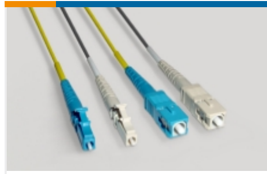
Fiber Optic Patch Cable Assemblies(8)