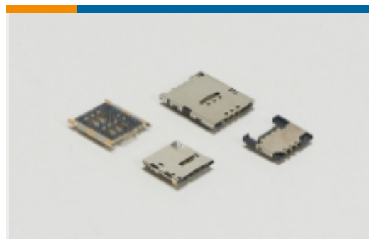
SIM Card Connectors(9)