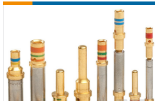
TE Part #0662-212-1631L CONT SOC ASSY