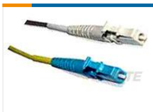
TE Part #6828095-1 CO KIT, LC, SM, SIM TIGHT