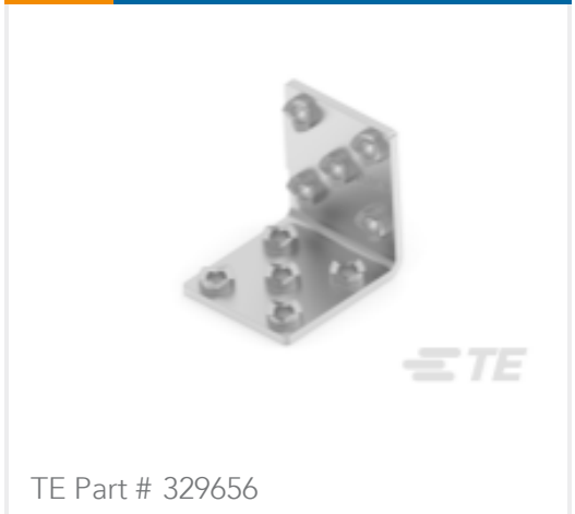
SPLICE, TERMI-FOIL DBL FACE