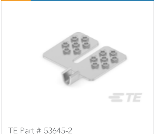
TERMINAL, TERMI-FOIL 16-14