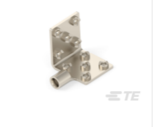
TE Part # 329860 TERMINAL,TERMI-FOIL 16-14