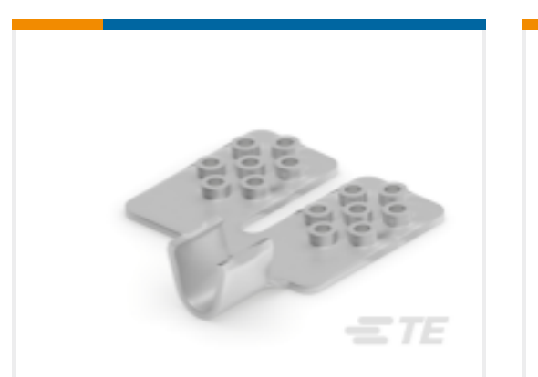
TE Part # 53644-2 TERMINAL,TERMI-FOIL 12-10