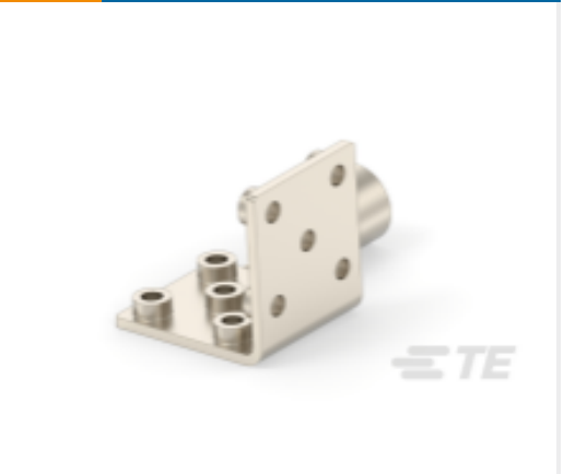
TE Part # 329254 TERMINAL,TERMI-FOIL 12-10