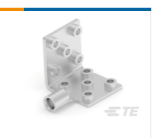
TE Part # 329860-1 TERMI-FOIL 16-14 DOUBLE FACE