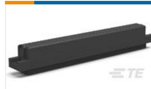
TE Part #746603-4 64 EUROLATCH LEAD FREE