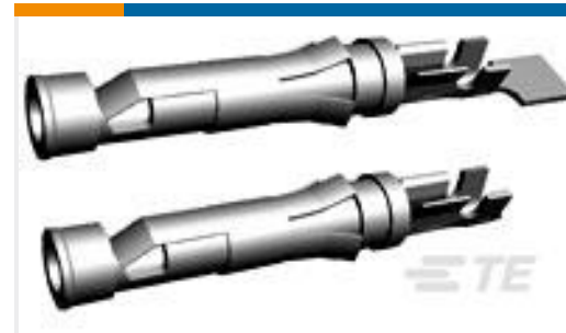
TE Part #1-66598-2 III+ SKT,18-14,TIN ,STRIP