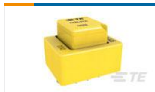
TE Part #2-1904058-5 V23700C0001A408-EV-CBOX