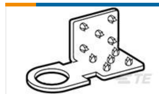
TE Part #276959-2 SPLICE,TERMI-FOIL TAP