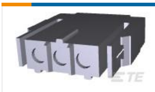
TE Part #207360-1 PLUG HSG,3 POSN,METRIC