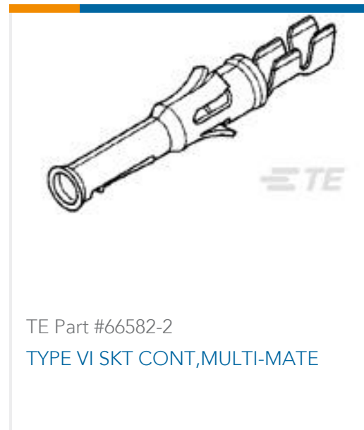
TE Part #66582-2 TYPE VI SKT CONT,MULTI-MATE