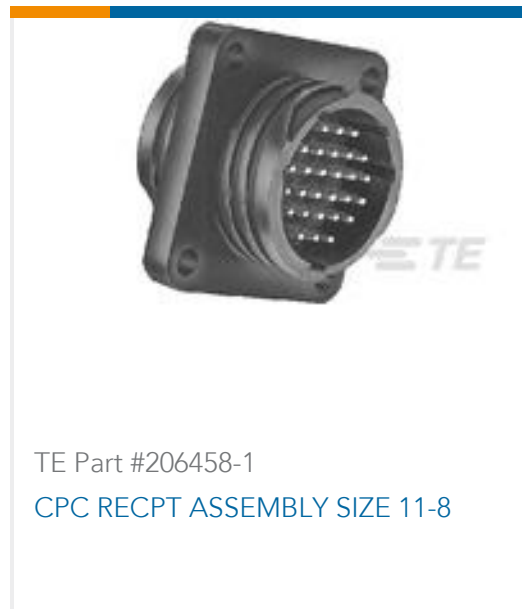
TE Part #206458-1 CPC RECP T ASSEMBLY SIZE 11-8