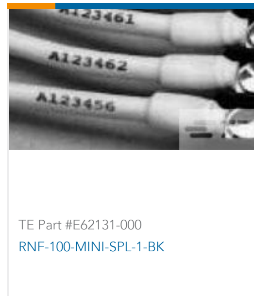
TE Part #E62131-000 RNF-100-MINI-SPL-1-BK