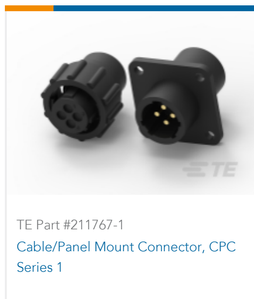
TE Part #211767-1 Cable/Panel Mount Connector, CPC Series 1