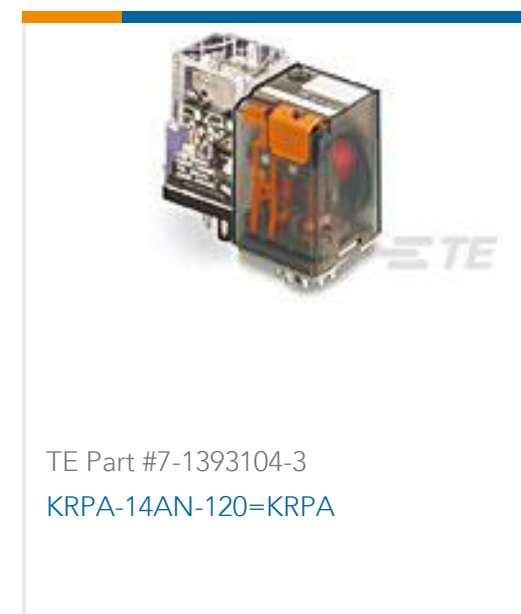
TE Part #7-1393104-3 KRPA-14AN-120=KRPA