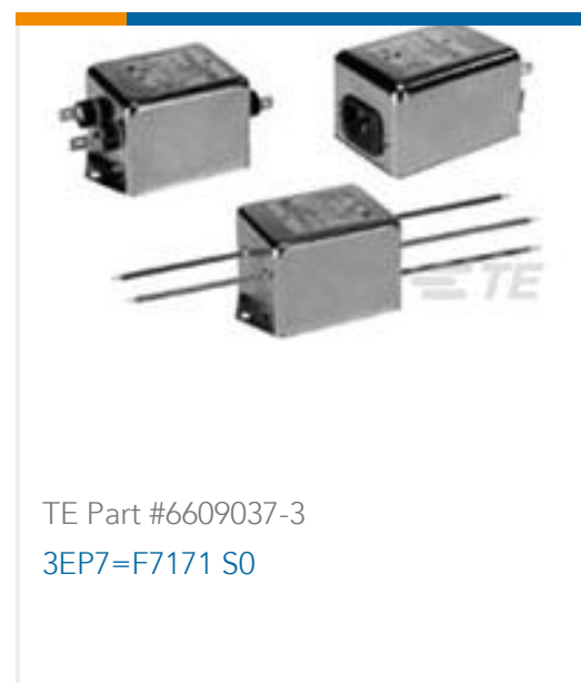
TE Part #6609037-3 3EP7=F7171 S0