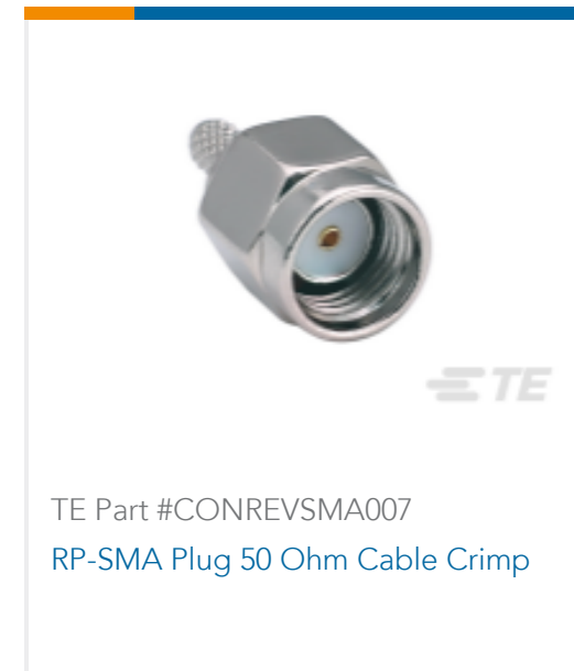
TE Part #CONREVSMA007 RP-SMA Plug 50 Ohm Cable Crimp