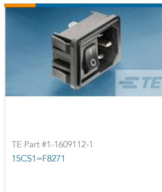
TE Part #1-1609112-1 15CS1=F8271