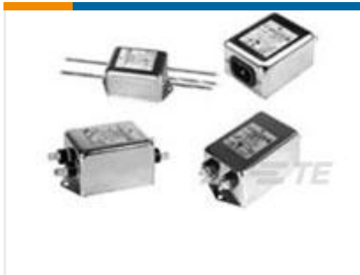
TE Part #1-6609031-3 10ER1=F7189