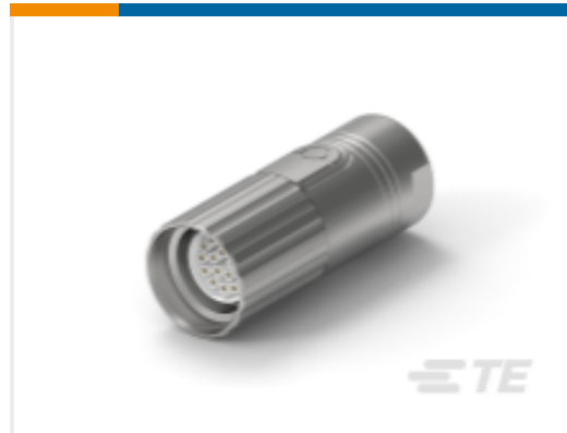
TE Part #ASA876N0085200A000 617 PLUG