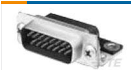
TE Part #5745434-8 09 PLUG RA/MS 454