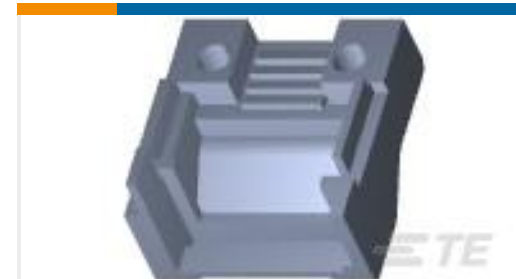
TE Part #316454-1 M-U-M-N-L PLUG CABLE CLAMP