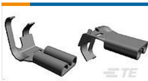
TE Part #42486-1 187 FASTON FLAG REC 20-16 AWG BR