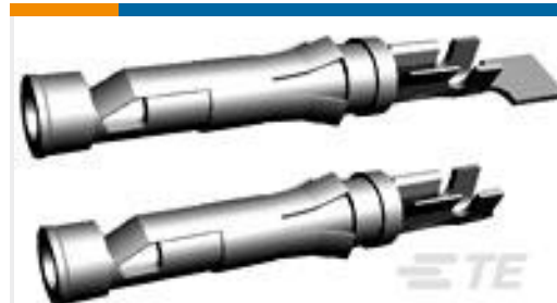
TE Part #66358-6 III+ SKT,18-14,TIN-LEAD,STRIP