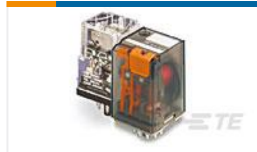
TE Part #2-1393104-5 KRPA-11AG-120=KRPA-