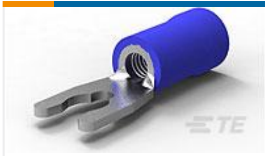
TE Part #52955 TERMINAL,PG SPR SPD 16-14 6