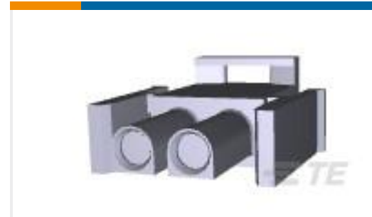
TE Part #1-350777-9 02P UMNL V0 PLUG HSG BLACK