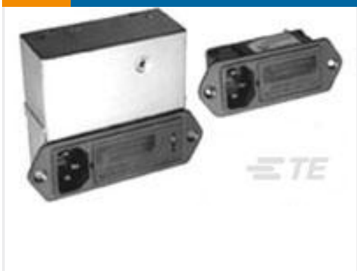
TE Part #2-6609129-2 5EFM1C=F8106