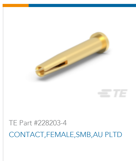
TE Part #228203-4 CONTACT, FEMALE, SMB, AU PLTD