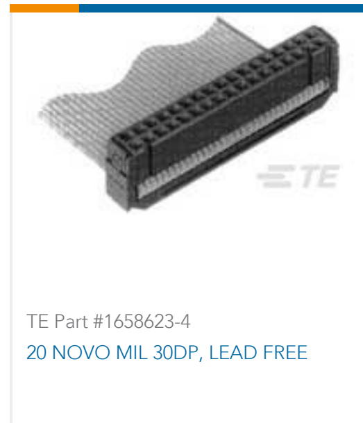
TE Part #1658623-4 20 NOVO MIL 30DP, LEAD FREE