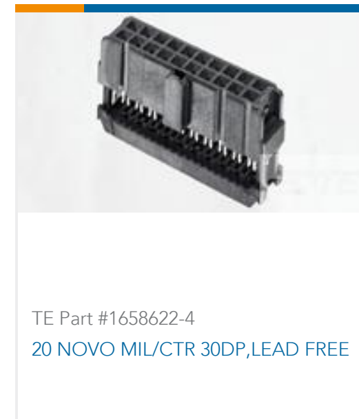
TE Part #1658622-4 20 NOVO MIL/CTR 30DP, LEAD FREE