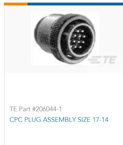
TE Part #206044-1 CPC PLUG ASSEMBLY SIZE 17-14