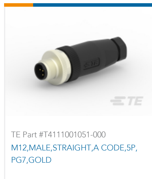
TE Part #T4111001051-000 M12, MALE, STRAIGHT, A CODE, 5P, PG7, GOLD