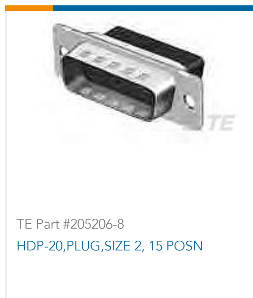
TE Part #205206-8 HDP-20, PLUG, SIZE 2, 15 POSN