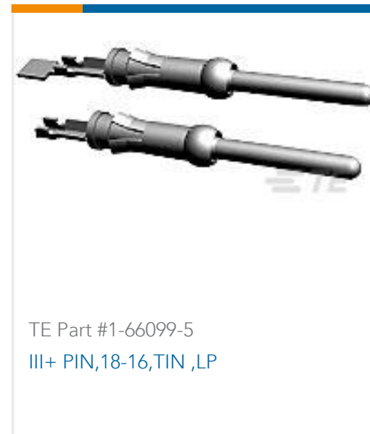
TE Part #1-66099-5 III+ PIN, 18-16, TIN, LP