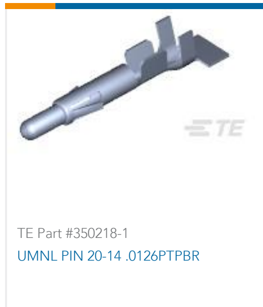
TE Part #350218-1 UMNL PIN 20-14 .0126PTPBR