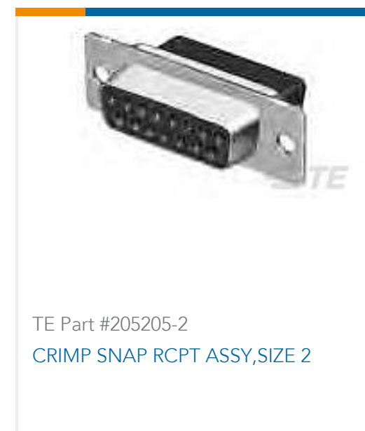
TE Part #205205-2 CRIMP SNAP RCPT ASSY, SIZE 2