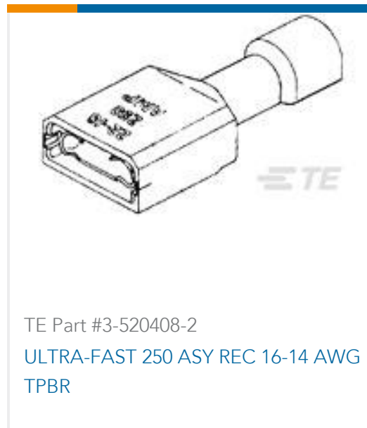
TE Part #3-520408-2 ULTRA-FAST 250 ASY REC 16-14 AWG TPBR