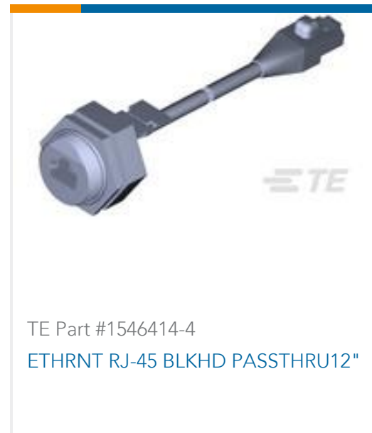
TE Part #1546414-4 ETHRNT RJ-45 BLKHD PASSTHRU12"