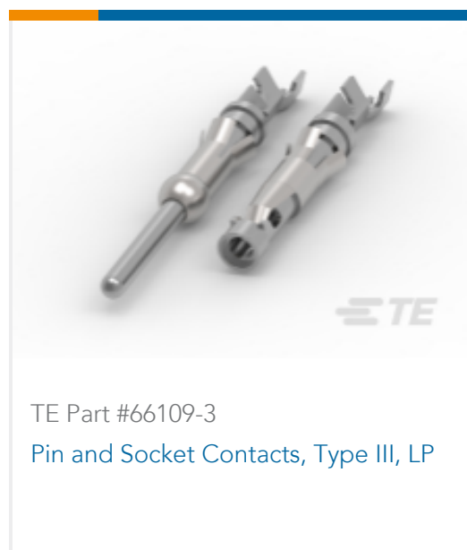
TE Part #66109-3 Pin and Socket Contacts, Type III, LP