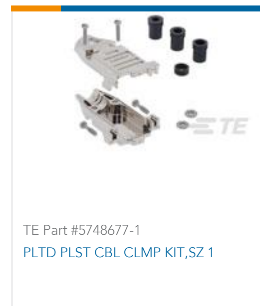
TE Part #5748677-1 PLTD PLST CBL CLMP KIT, SZ 1