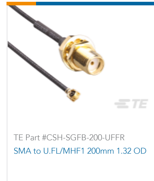
TE Part #CSH-SGFB-200-UFFR SMA to U.FL/MHF1 200mm 1.32 OD