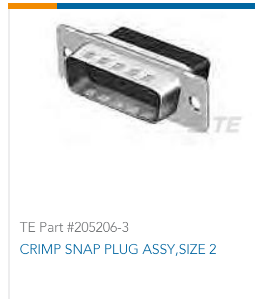
TE Part #205206-3 CRIMP SNAP PLUG ASSY, SIZE 2