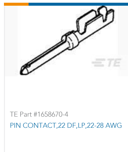
TE Part #1658670-4 PIN CONTACT, 22 DF, LP, 22-28 AWG