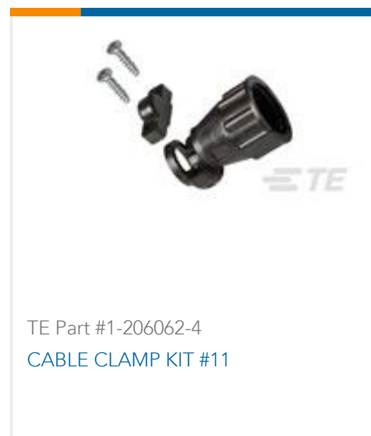
TE Part #1-206062-4 CABLE CLAMP KIT #11