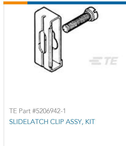
TE Part #5206942-1 SLIDELATCH CLIP ASSY, KIT