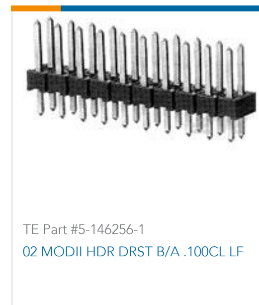
TE Part #5-146256-1 02 MODII HDR DRST B/A .100CL LF