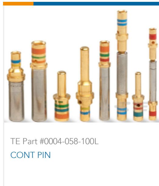
TE Part #0004-058-100L CONT PIN