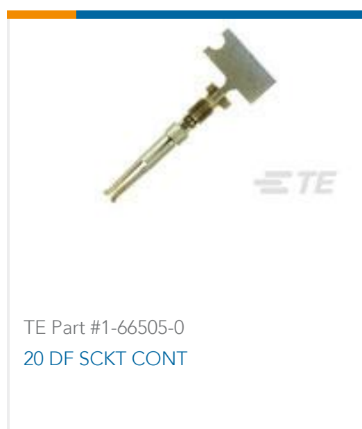
TE Part #1-66505-0 20 DF SCKT CONT