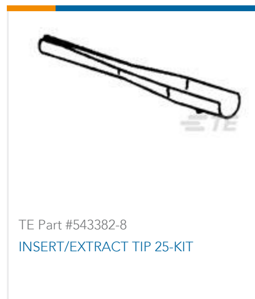
TE Part #543382-8 INSERT/EXTRACT TIP 25-KIT