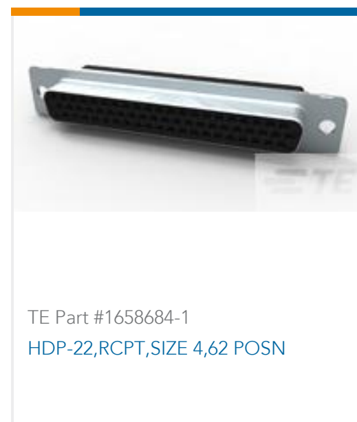
TE Part #1658684-1 HDP-22,RCPT,SIZE 4,62 POSN