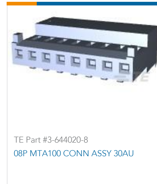
TE Part #3-644020-8 08P MTA100 CONN ASSY 30AU