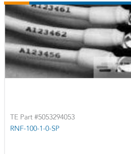
TE Part #5053294053 RNF-100-1-0-SP