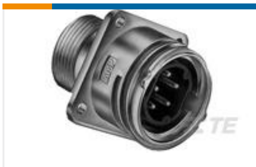
TE Part #208459-1 CMC RECPT ASSEMBLY SIZE 28