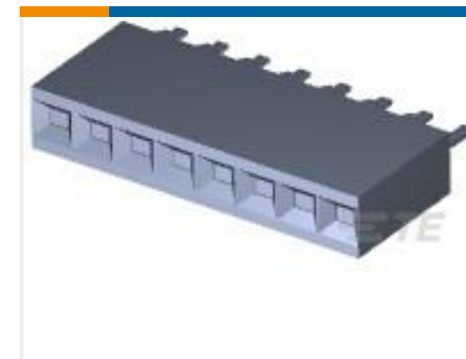
TE Part #5-534237-6 08 MODII VRT SR CE 100/115