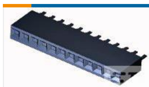
TE Part #6-534237-0 12 MODII VRT SR CE 100/115