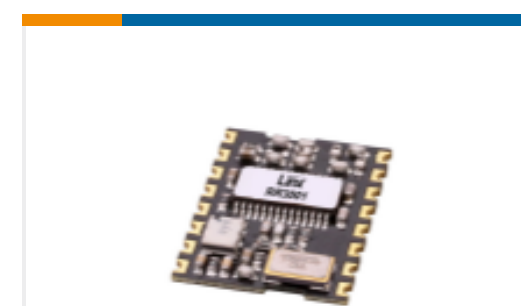
TE Part #RXM-315-LR Module LR 315MHz AM OOK RX RCVR Screw #6