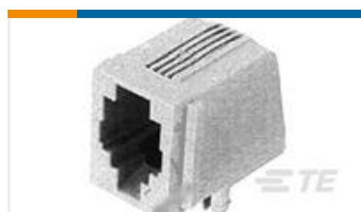
TE Part #5555980-1 MJ,R/A,4P/4C,TRAY PACK