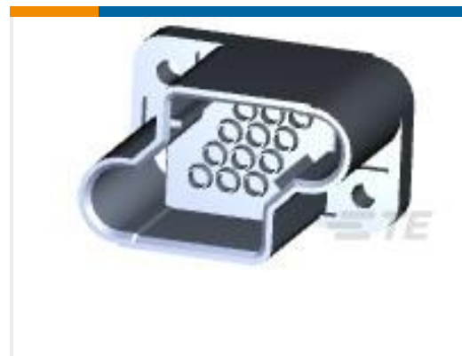
TE Part #211759-1 RECEPT HSG,12 POSN,METRIMATE