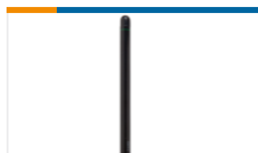
TE Part #ANT-315-PW-RA Antenna 1/4 Wave 315MHz Swivel Screw #6