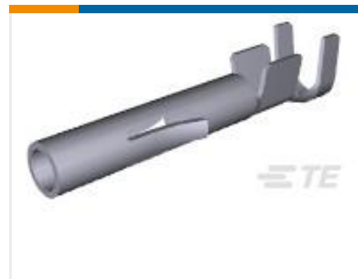
TE Part #350536-3 UMNL SOK 20-14 .0125 PTPPHBZ