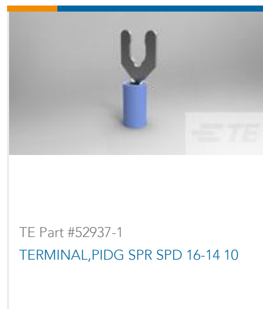
TE Part #52937-1 TERMINAL,PIDG SPR SPD 16-14 10