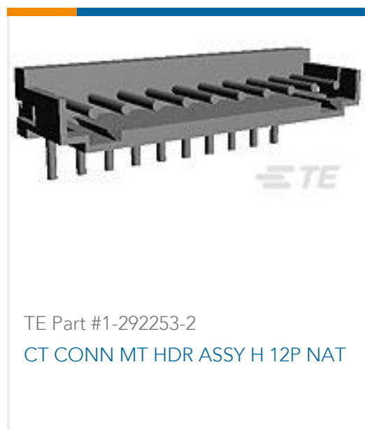
TE Part #1-292253-2 CT CONN MT HDR ASSY H 12P NAT