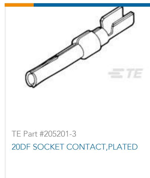
TE Part #205201-3 20DF SOCKET CONTACT,PLATED