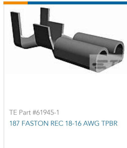
TE Part #61945-1 187 FASTON REC 18-16 AWG TPBR