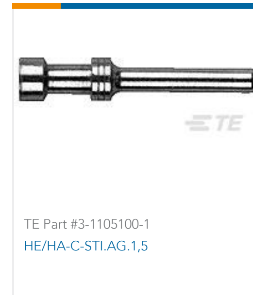
TE Part #3-1105100-1 HE/HA-C-STI.AG.1,5