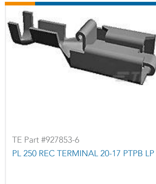
TE Part #927853-6 PL 250 REC TERMINAL 20-17 PTPB LP