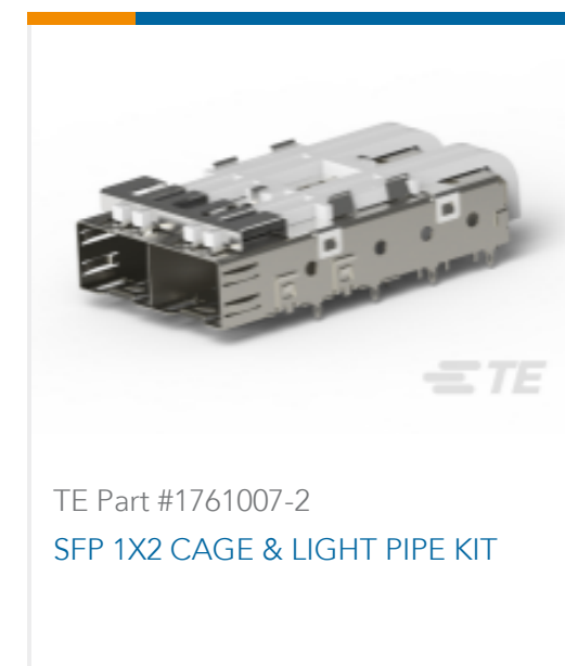
TE Part #1761007-2 SFP 1X2 CAGE & LIGHT PIPE KIT