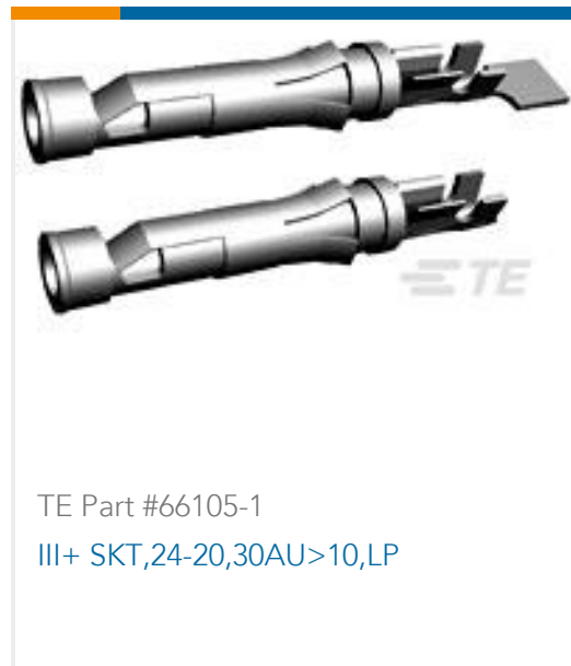
TE Part #66105-1 III+ SKT,24-20,30AU>10,LP