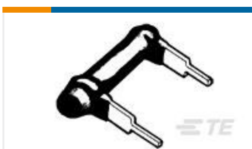
TE Part #1623714-1 FCB4 100R 5% HP