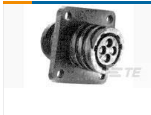
TE Part #206430-1 RECEPT, SZ 11-4, CPC