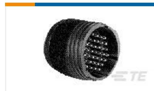
TE Part #206036-3 RECEPT, SZ 17-16, CPC