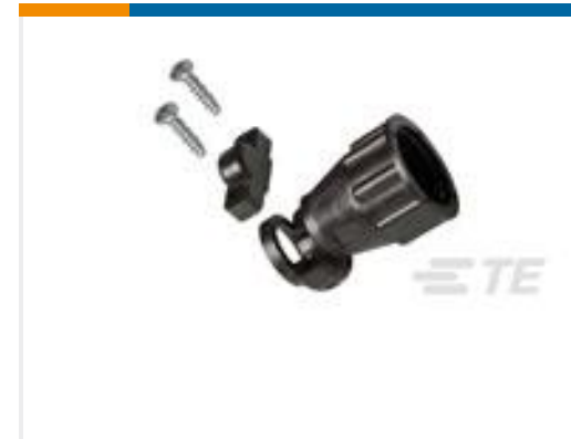
TE Part #1-206062-4 CABLE CLAMP KIT #11