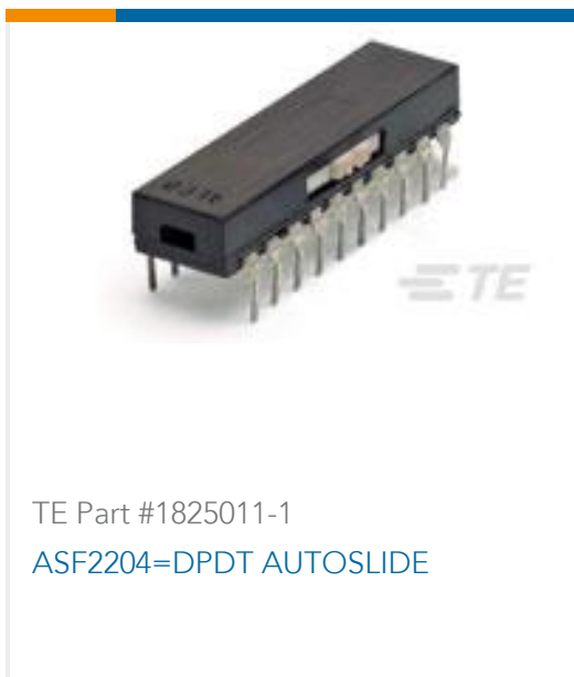
TE Part #1825011-1 ASF2204=DPDT AUTOSLIDE