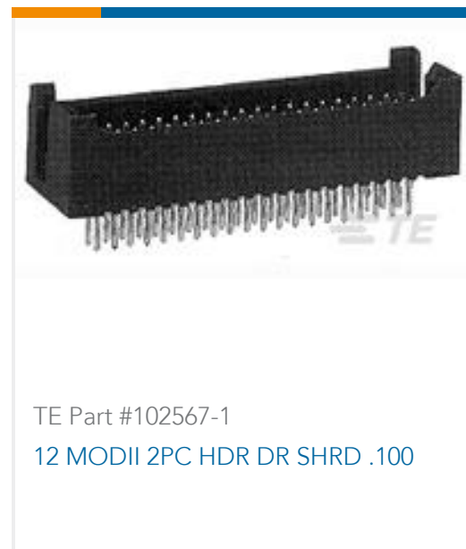
TE Part #102567-1 12 MODII 2PC HDR DR SHRD .100