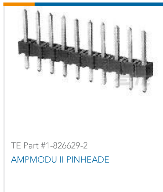
TE Part #1-826629-2 AMPMODU II PINHEADE