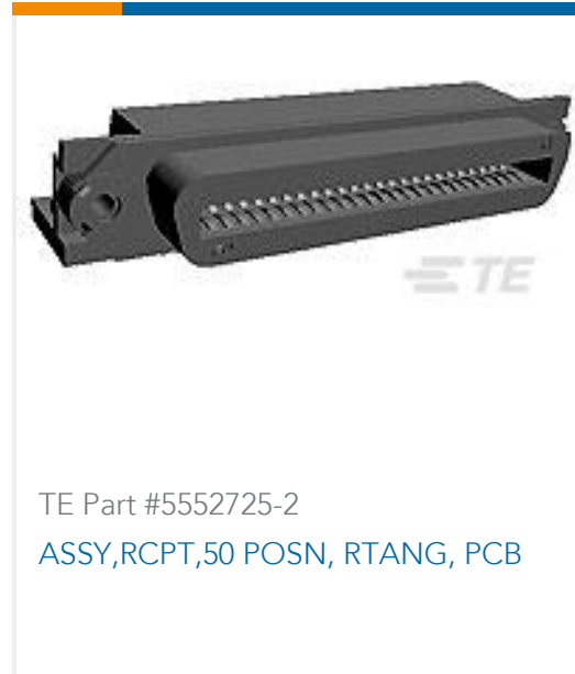
TE Part #5552725-2 ASSY,RCPT,50 POSN, RTANG, PCB