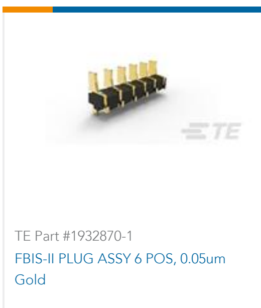
TE Part #1932870-1 FBIS-II PLUG ASSY 6 POS, 0.05um Gold