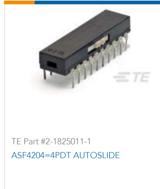
TE Part #2-1825011-1 ASF4204=4PDT AUTOSLIDE