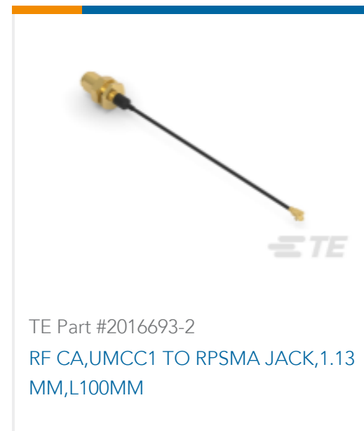
TE Part #2016693-2 RF CA,UMCC1 TO RPSMA JACK,1.13 MM,L100MM