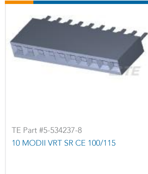
TE Part #5-534237-8 10 MODII VRT SR CE 100/115