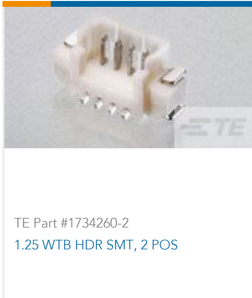
TE Part #1734260-2 1.25 WTB HDR SMT, 2 POS