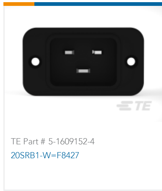
TE Part # 5-1609152-4 20SRB1-W=F8427