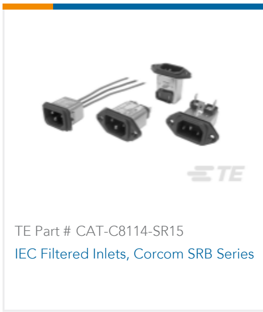
TE Part # CAT-C8114-SR15 IEC Filtered Inlets, Corcom SRB Series