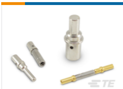
TE Part #0462-201-16141 DEUTSCH Solid Contacts