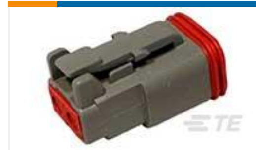
TE Part #DT06-2S PLG, 2P, GRY, N