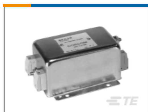
TE Part # CAT-C8114-F299B Single Phase Filters, Corcom FC Series