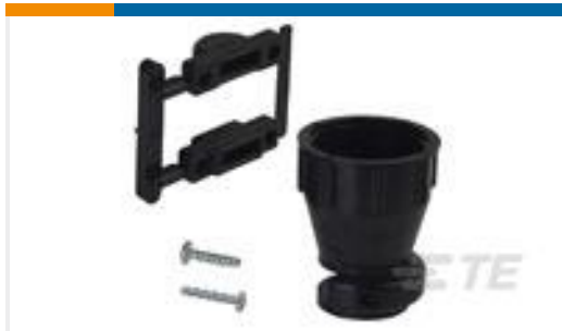
TE Part #206070-8 CABLE CLAMP KIT #17