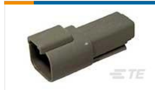
TE Part #DT04-2P REC, 2P, GRY, N