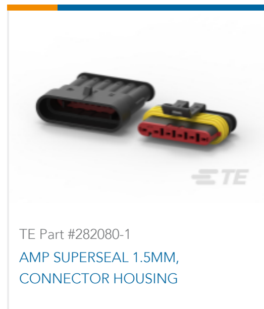
TE Part #282080-1 AMP SUPERSEAL 1.5MM, CONNECTOR HOUSING