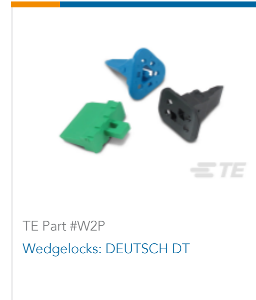
TE Part #W2P Wedgelocks: DEUTSCH DT