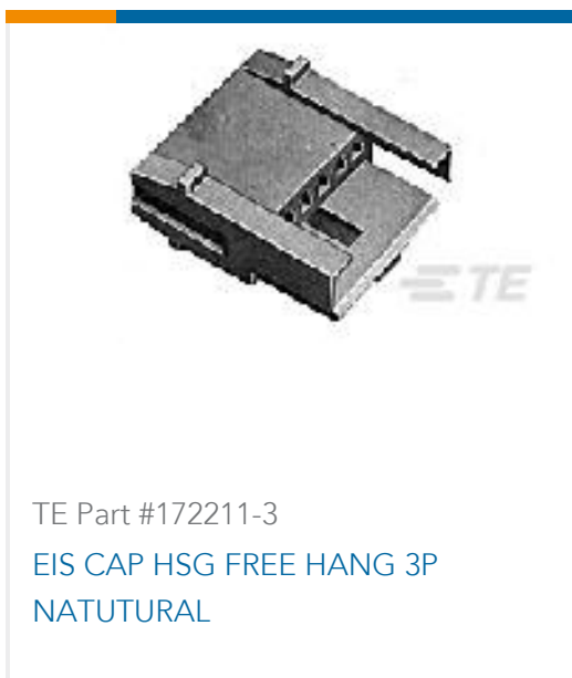
TE Part #172211-3 EIS CAP HSG FREE HANG 3P NATURAL