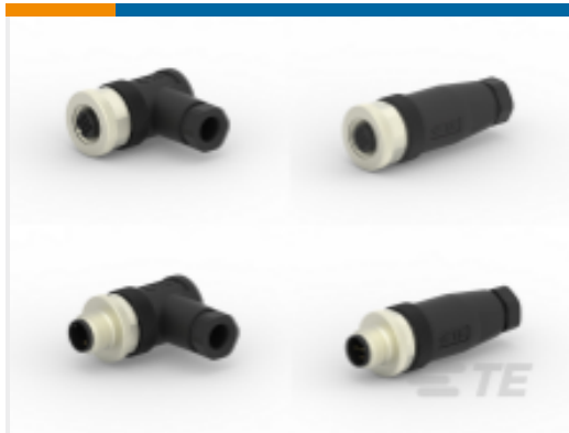
TE Part #T4110001051-000 M12 Field Installable Unshielded