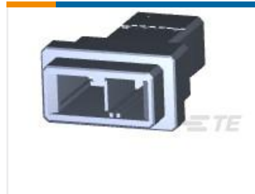
TE Part #1-179552-2 DYNAMIC D-3200S TAB HSG 2P K/X