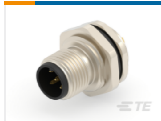
TE Part #T4130012051-000 M12,REAR MOUNT,MALE,A,5P, SOLDER WIRE