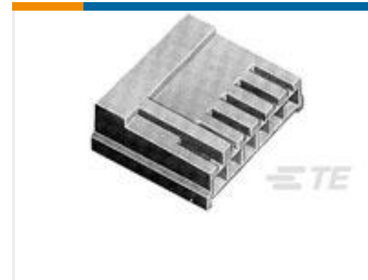
TE Part #171822-2 EIS REC. HSG 2P-NATURAL