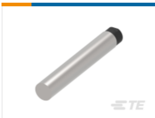
TE Part #098-10001 ML SENSOR .25 DIA EPOXY W/QDIS