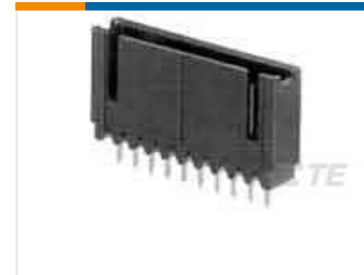
TE Part #5-103080-5 07 MODII HDR SRST SHRD .100CL