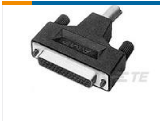
TE Part #5748641-1 KIT,RCPT,44P,HDP-22,SHLD ENCLSRE