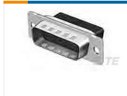
TE Part #207464-7 HDP-20,PLUG,SIZE 3, 25 POSN