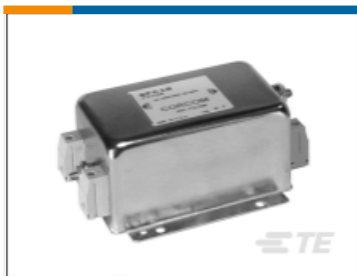
TE Part # CAT-C8114-F299B Single Phase Filters, Corcom FC Series