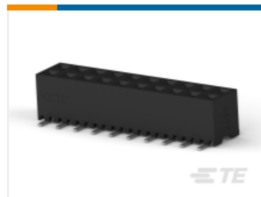
TE Part #2-2307819-0 20P,2MM,BB,REC,DRVT,SMD,AU.76, TR,W/CP