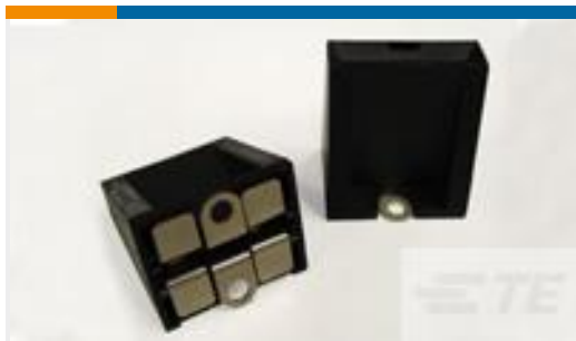
TE Part #1643903-1 CROWN CLIP Senior II 538-0068-00100