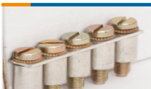
TE Part #1SNA178032R2500 BJD6