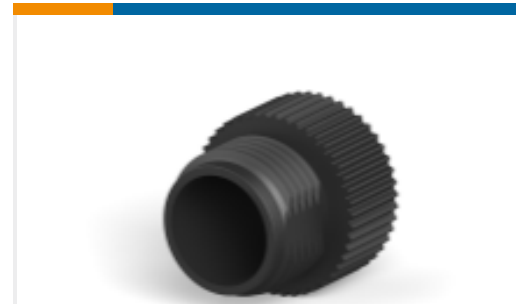
TE Part #2823064-1 M12-DUST CAP-FEMALE CONN-IP67- W/O SLEEVE