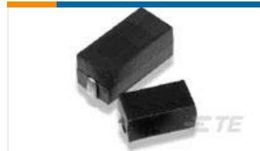
TE Part #6-1879021-7 SMW3 56R 5%