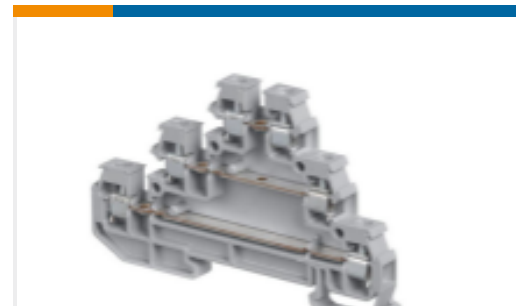
TE Part #1SNA115541R1100 D2.5/6.DA