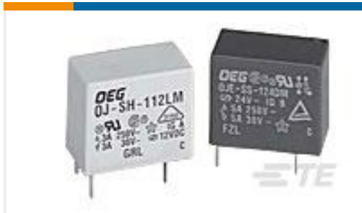
TE Part #1461406-4 OJ-SH-112DM,000