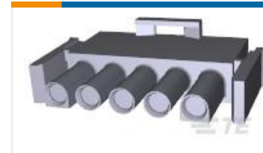
TE Part #350809-1 05P UMNL PLUG HSG