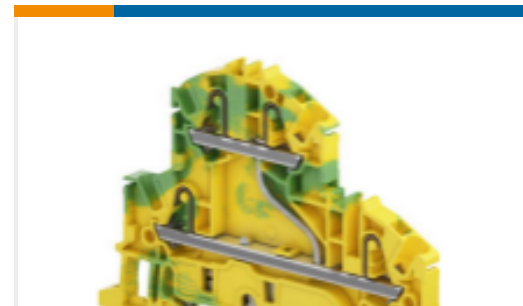
TE Part #1SNK705250R0000 ZK2.5-D1-PE