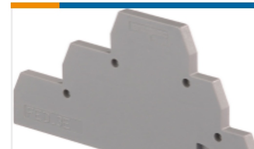
TE Part #1SNA116771R2000 FED3E